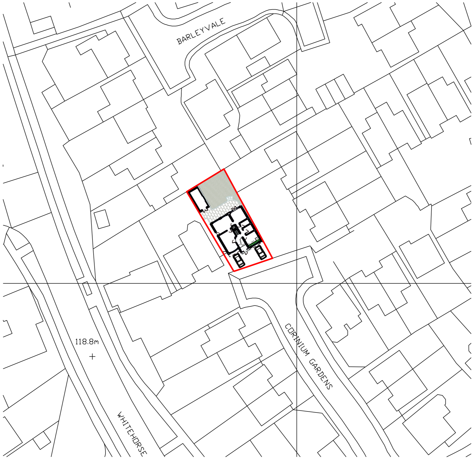
02 LOCATION PLAN 001 A1/A3 @ 1:250/ 1:500