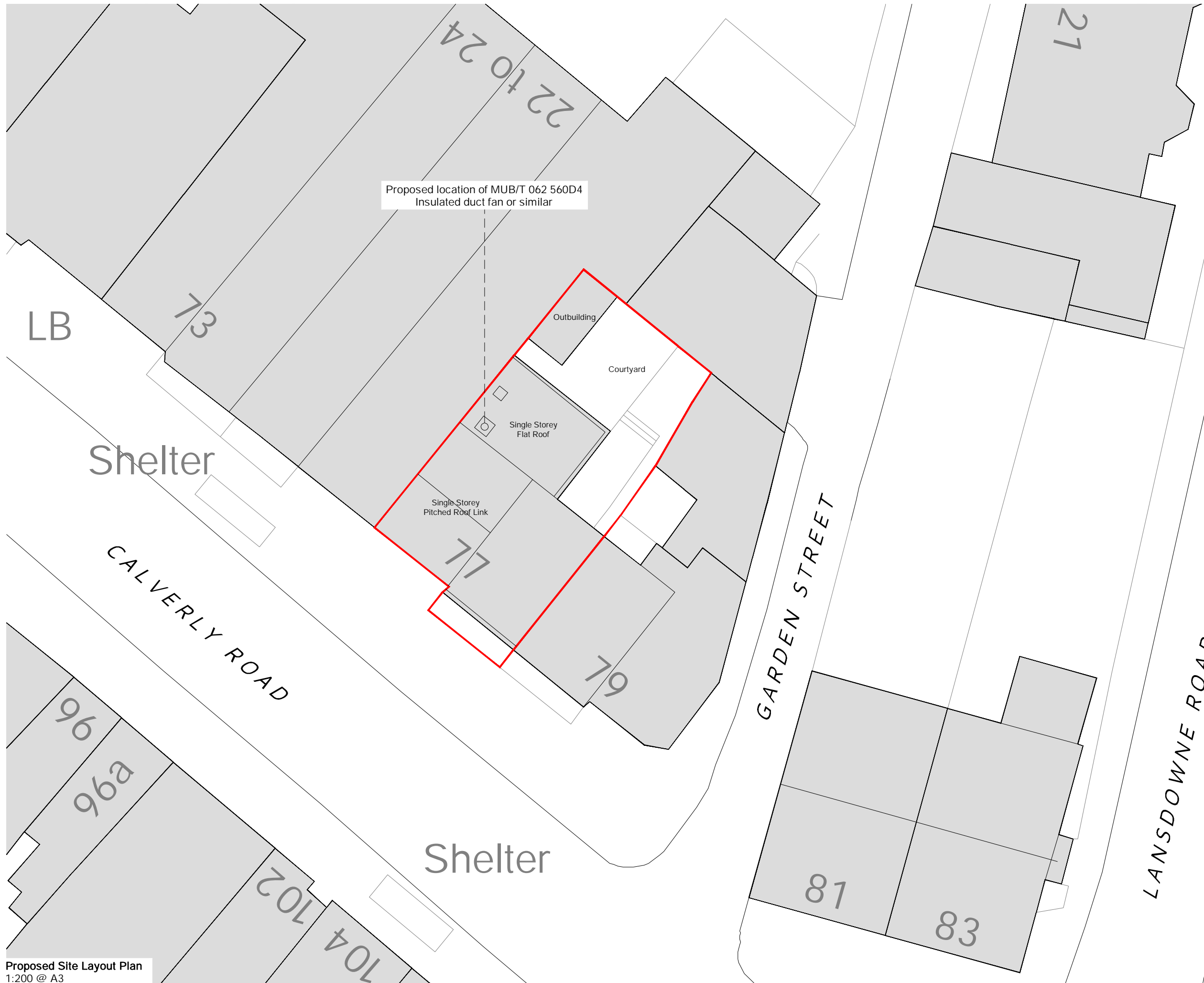
Proposed Site Layout Plan 1:200 @ A3