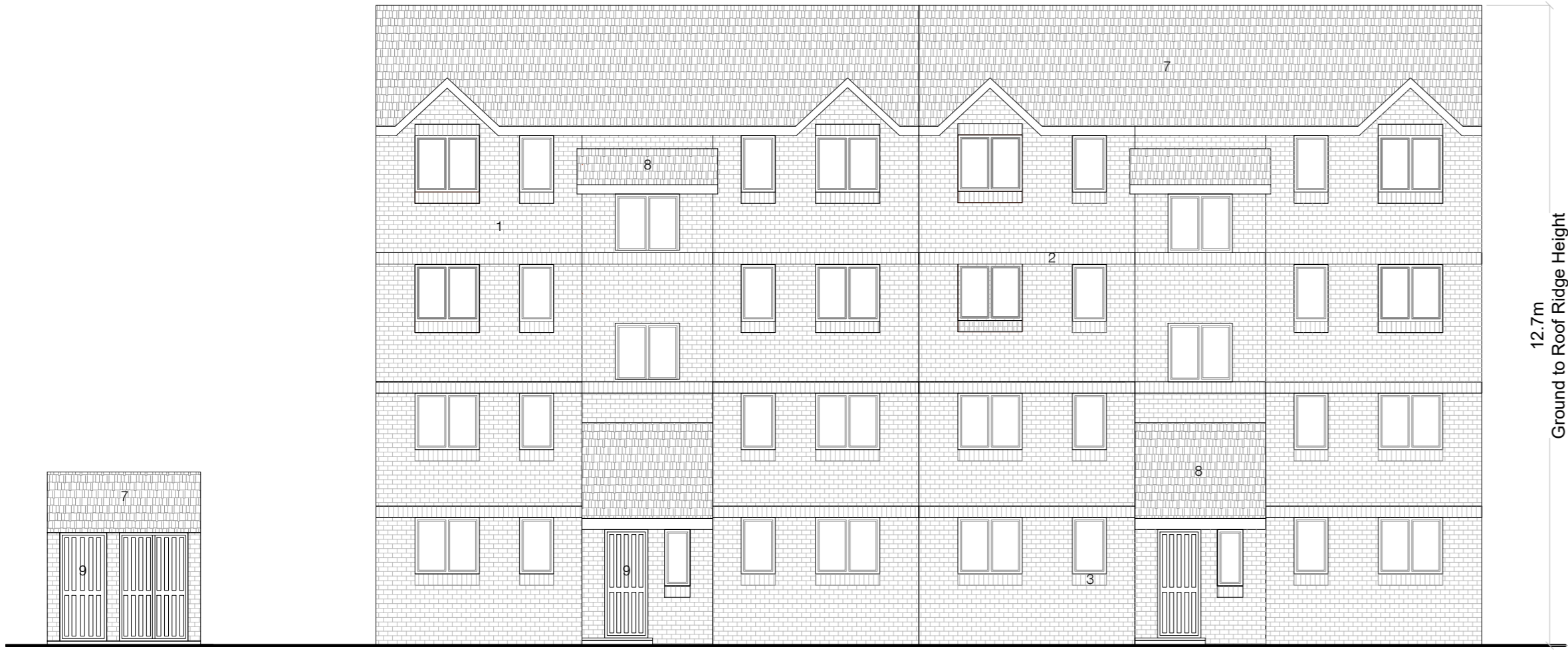
1 Proposed South Elevation 1:100