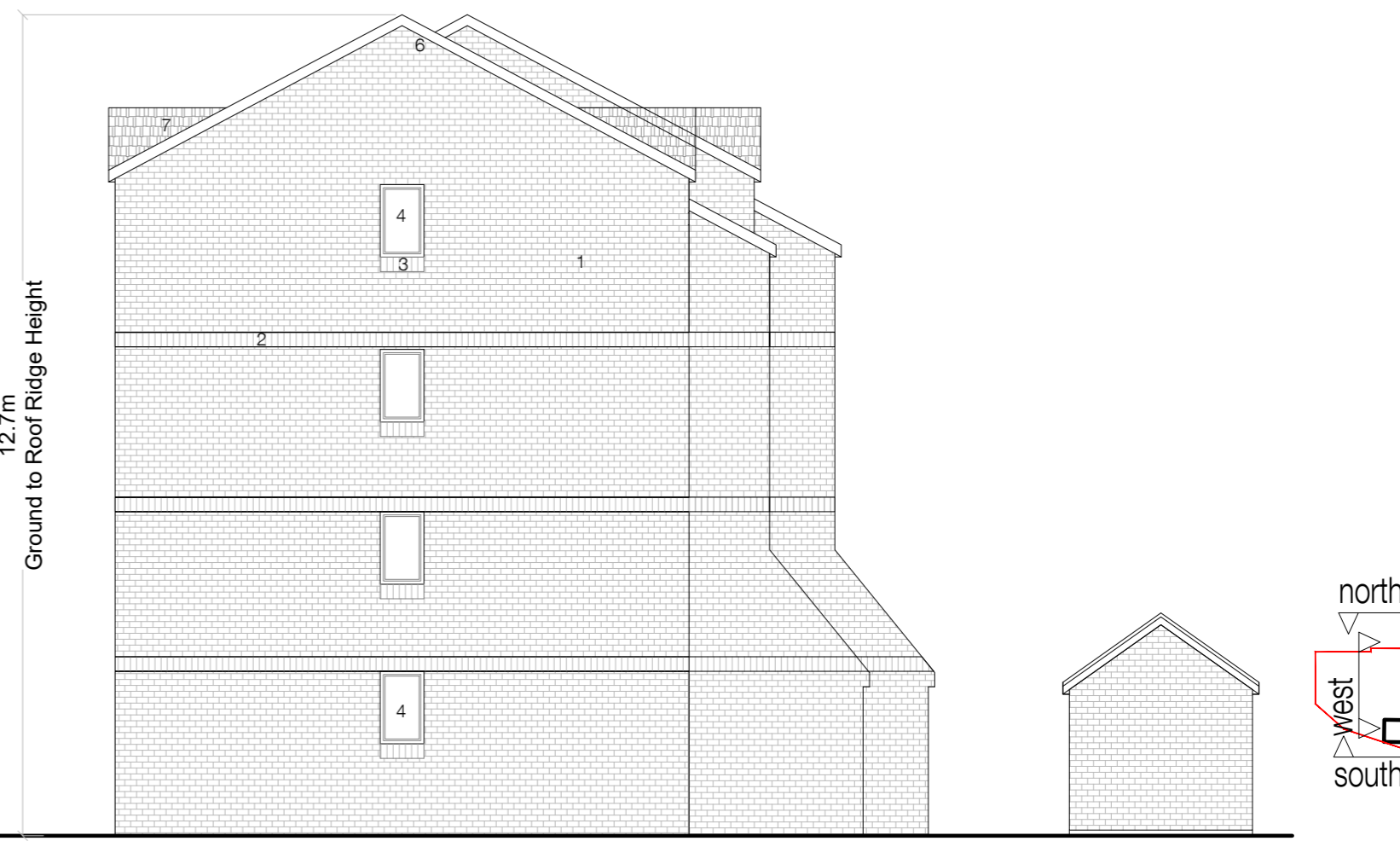
4 Proposed East Elevation 1:100