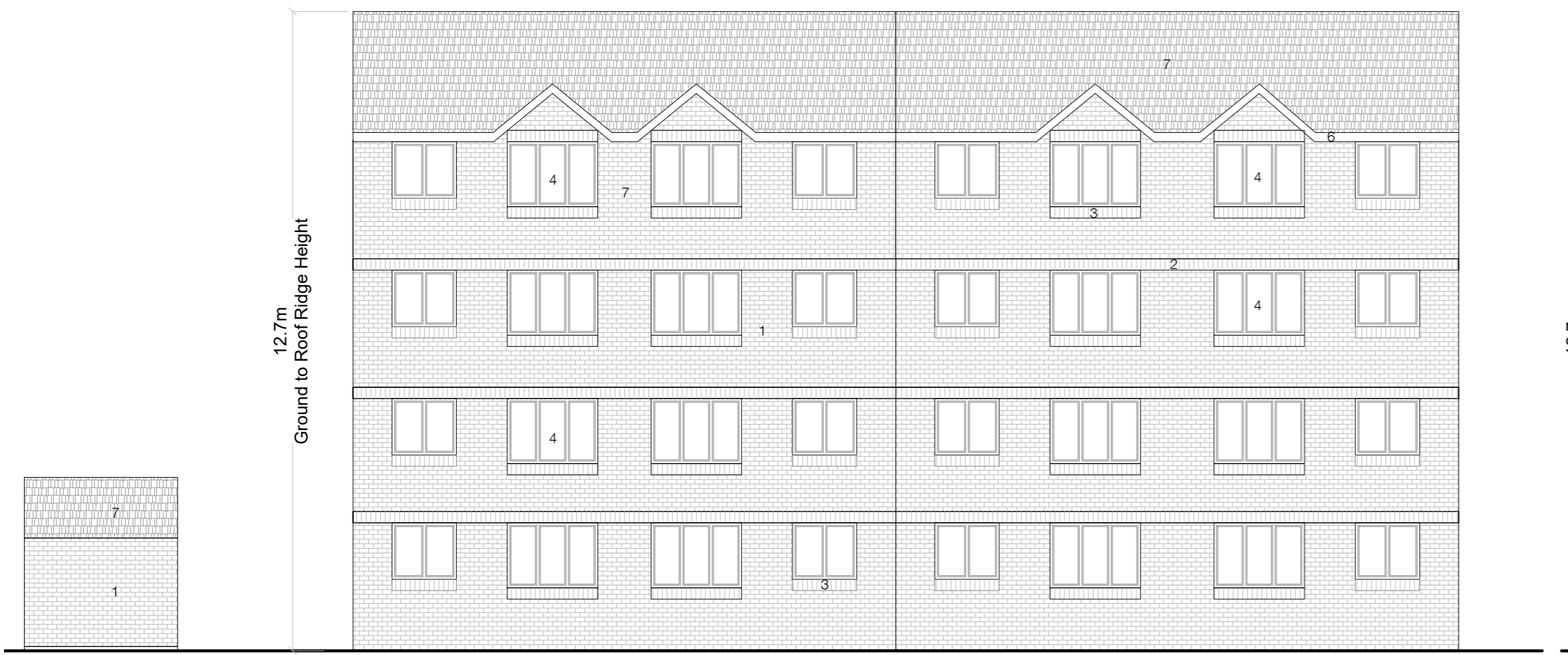
2 Proposed North Elevation 1:100