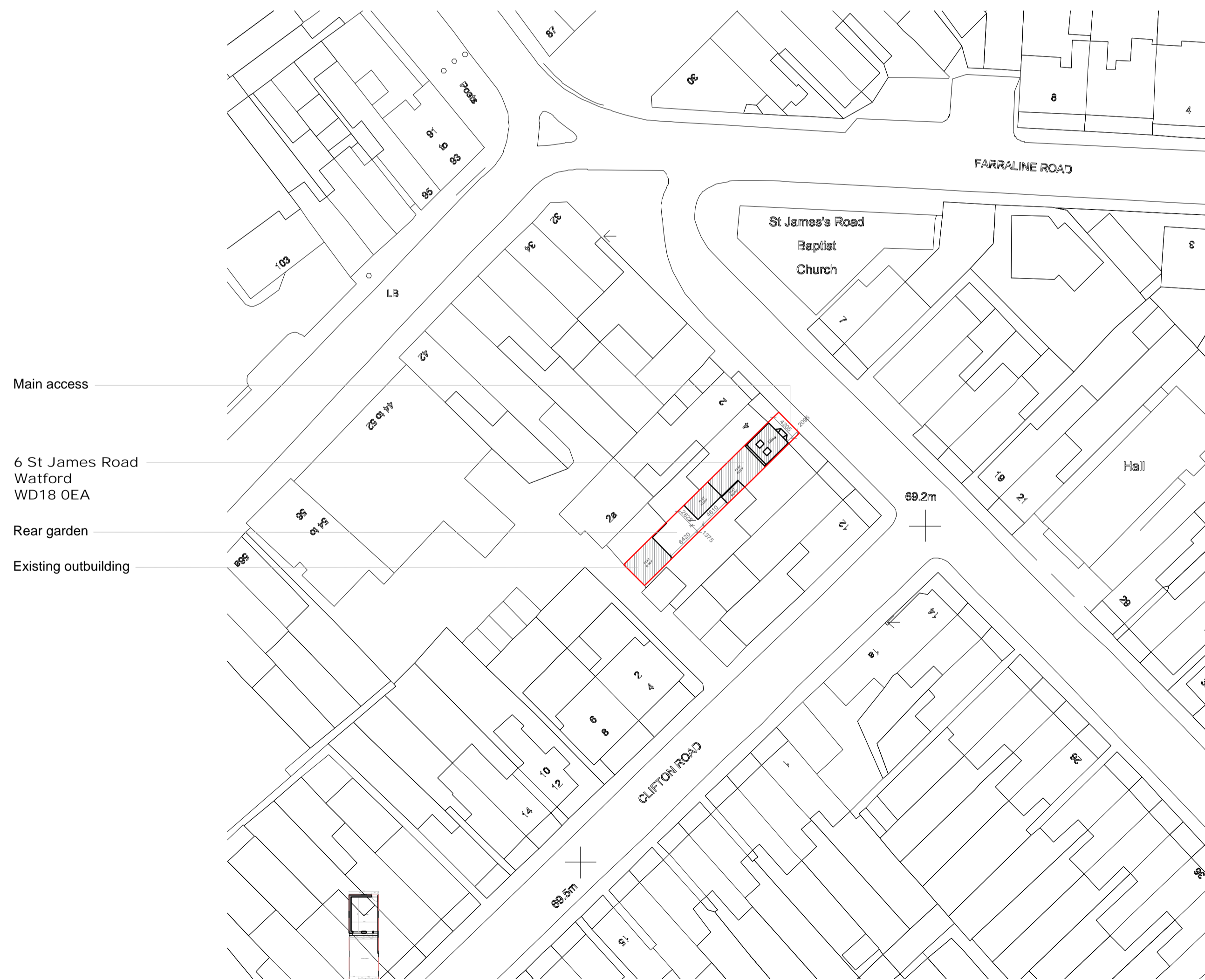
② Scale 1:500 at A1