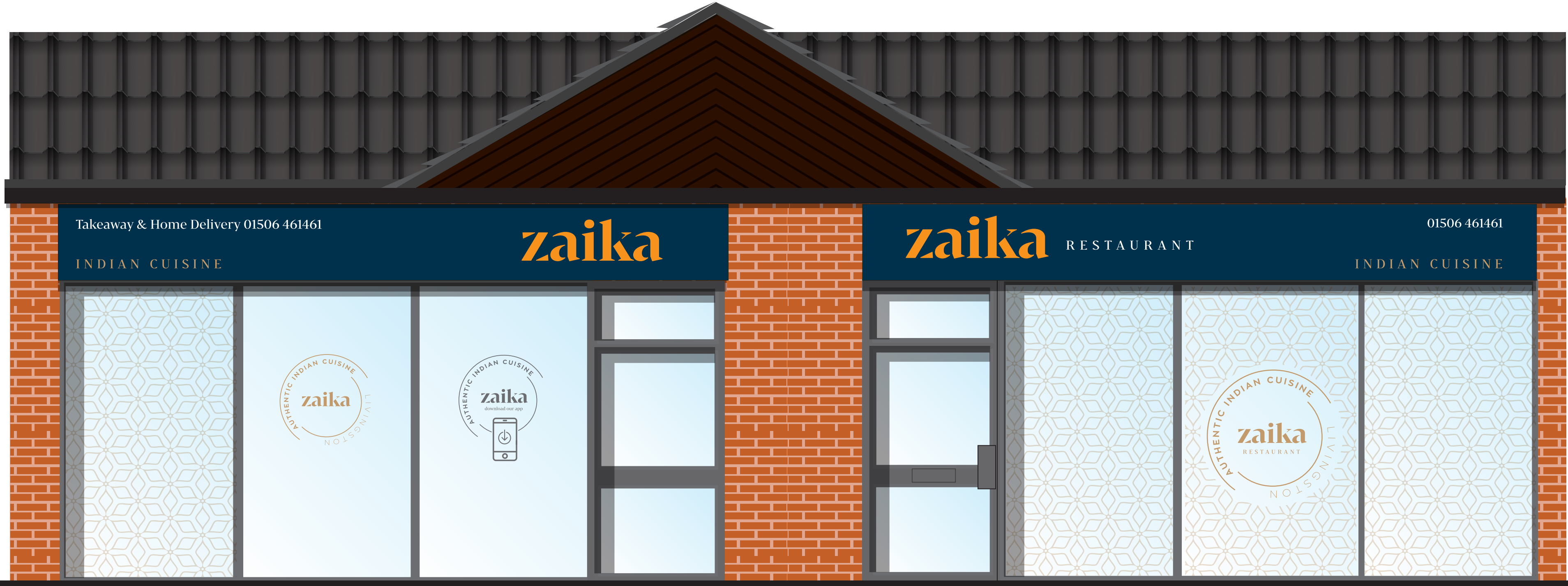
PROPOSED RESTAURANT ELEVATION