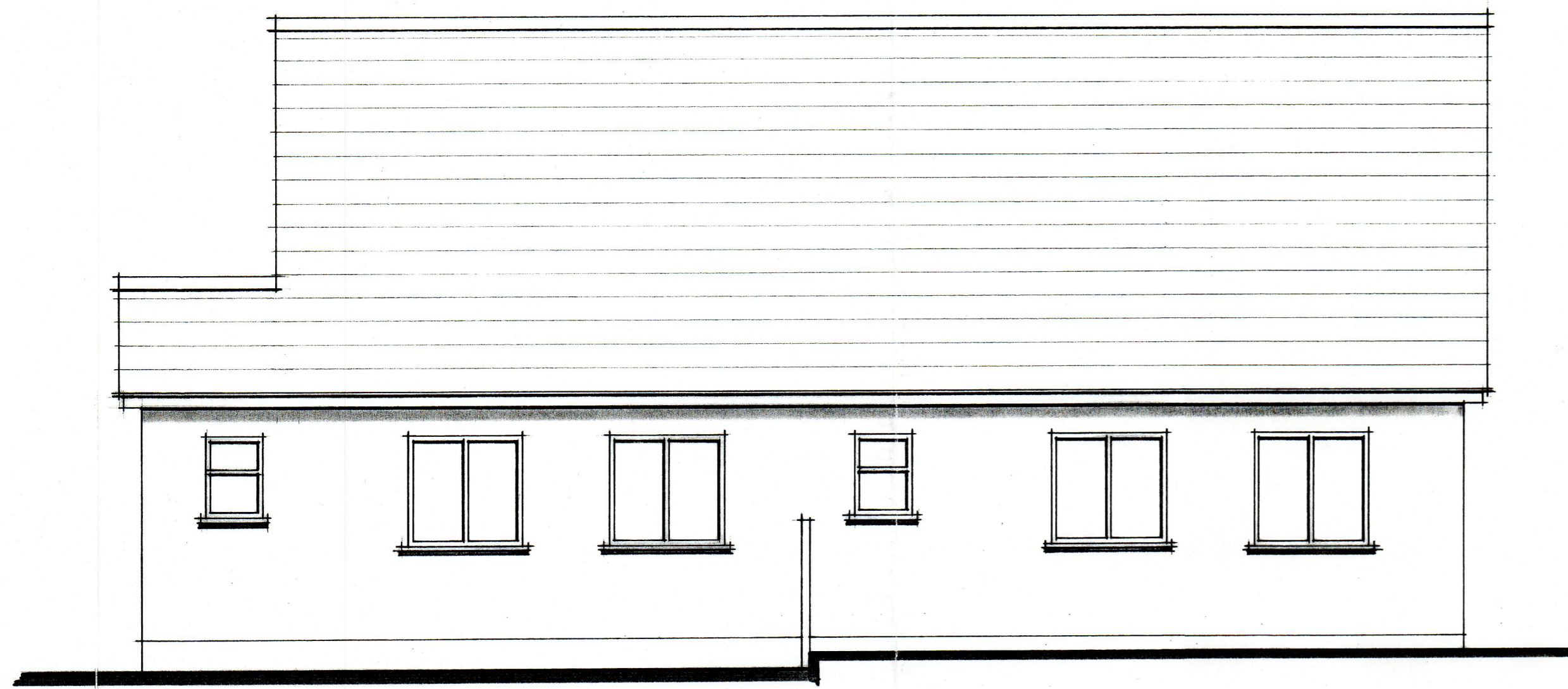
FRONT SOUTH 1:50