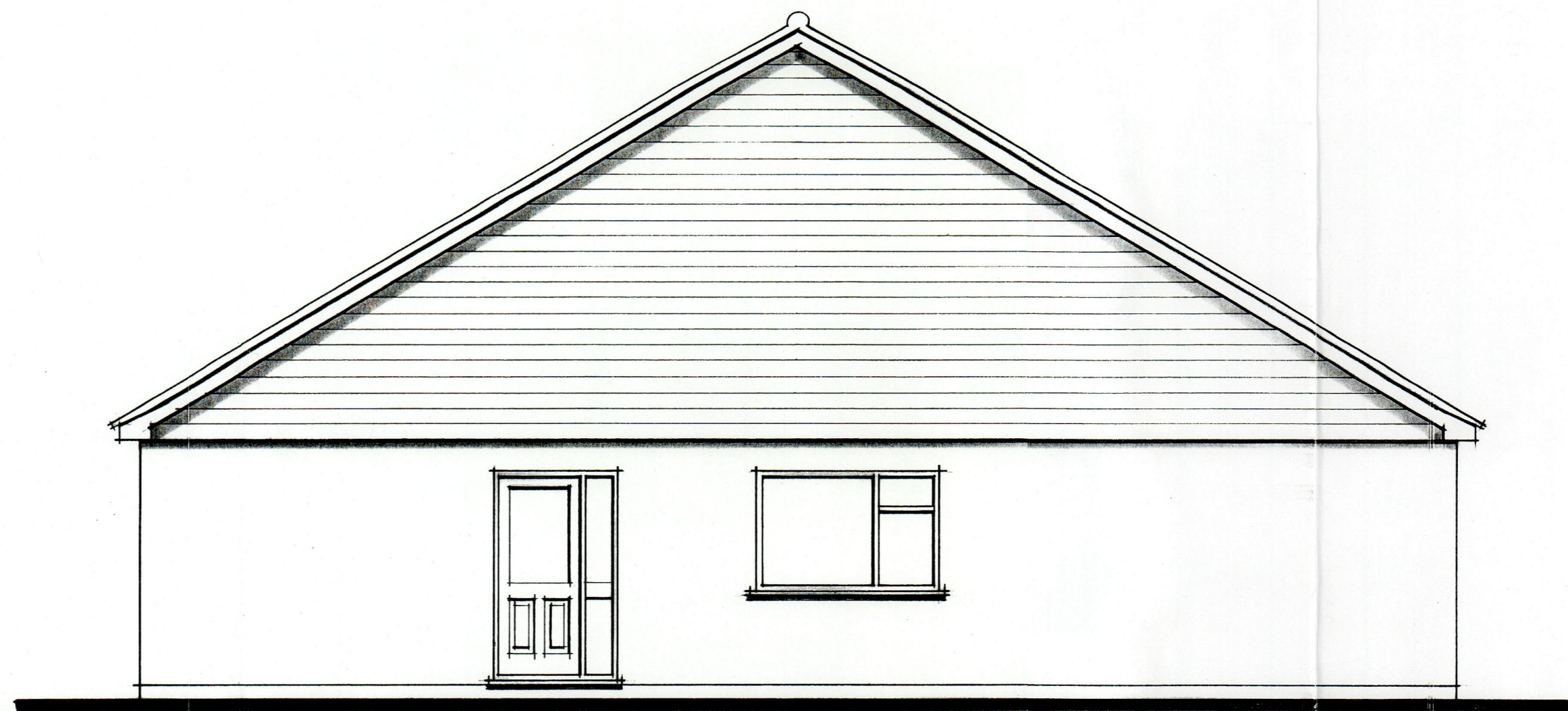
SIDE EAST 1:50