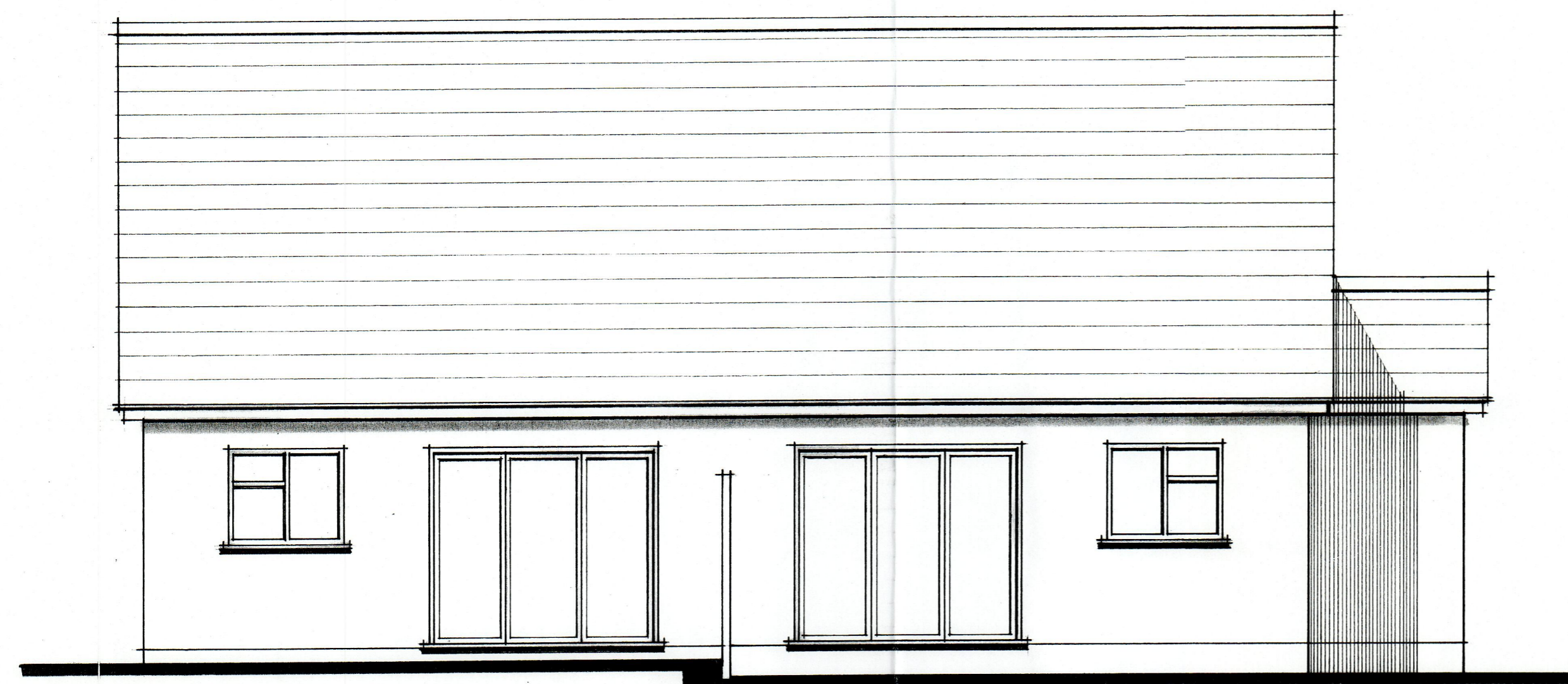
REAR NORTH 1:50