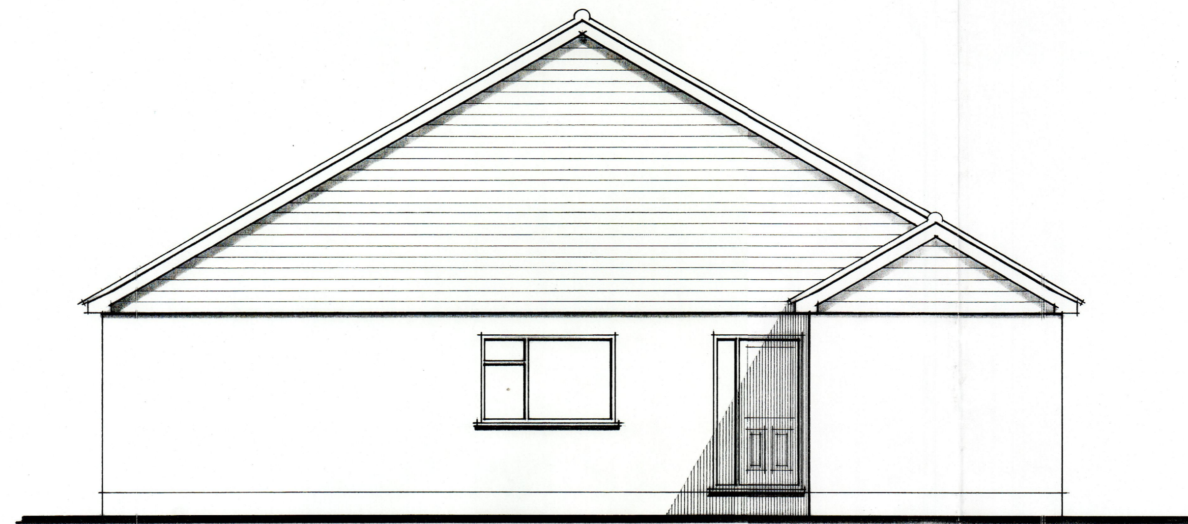
SIDE WEST 1:50