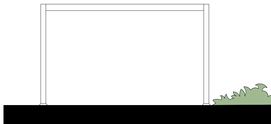
3 ELEVATION Proposed Pergola Rear Elevation SCALE 1: 50