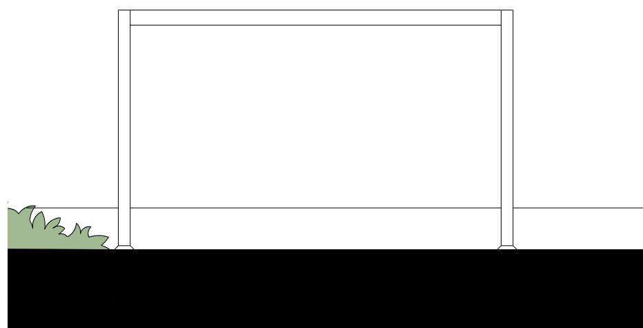
1 ELEVATION Proposed Pergola Front Elevation SCALE 1: 50

For construction purposes do not scale from this drawing Use figured dimensions only If in doubt ask All dimensions to be checked on site Work to be carried out in accordance with by-laws and regulations of local authorities and statutory undertakers notes