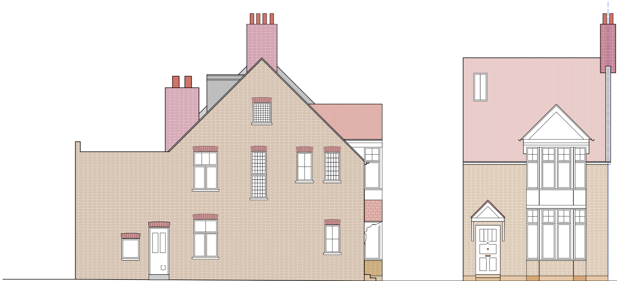
Outer Flank Elevation

Do not scale dimensions off this drawing. Check all dimensions and report any discrepancies to the Architect before proceeding with the works. Notify the Architect immediately of any discrepancies between the drawings and other contract documents.