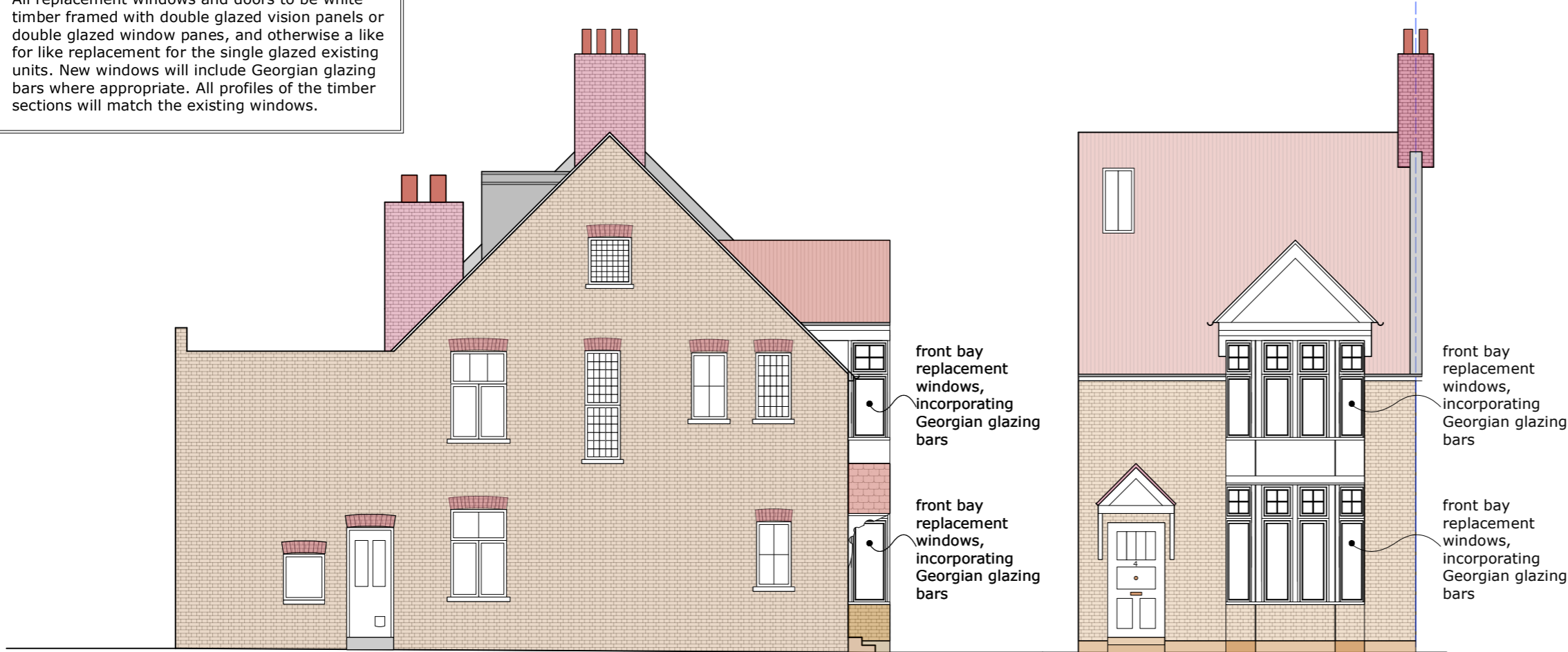
Outer Flank Elevation

Drawing to be read in conjunction with detailed window and door sections, manufacturer's brochures, order form and photos.