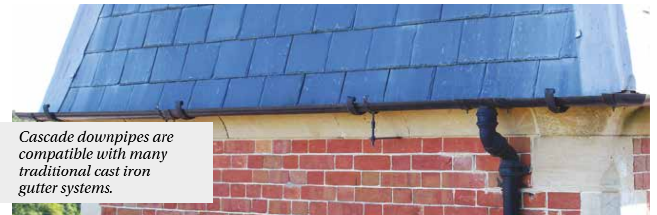
Cascade downpipes are compatible with many traditional cast iron gutter systems.