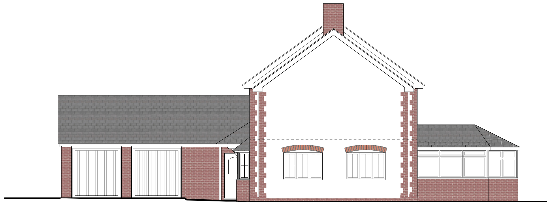
5 Proposed North East Elevation 1:100