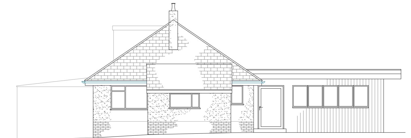
North scale 1:100