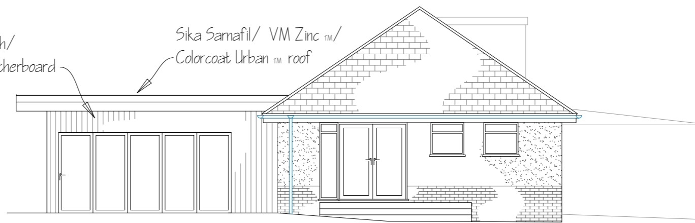
South scale 1:100