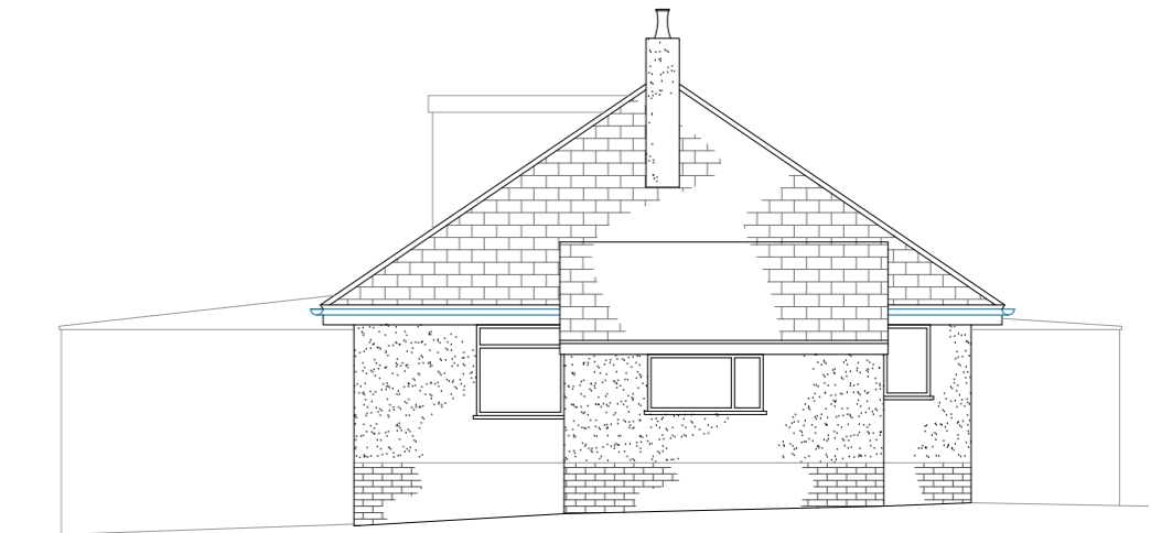
North scale 1:100