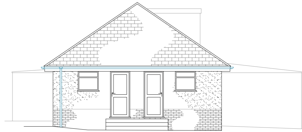
South scale 1:100