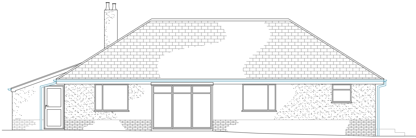
West scale 1:100 Tiled Roof Rendered Walls PVC Windows & Doors