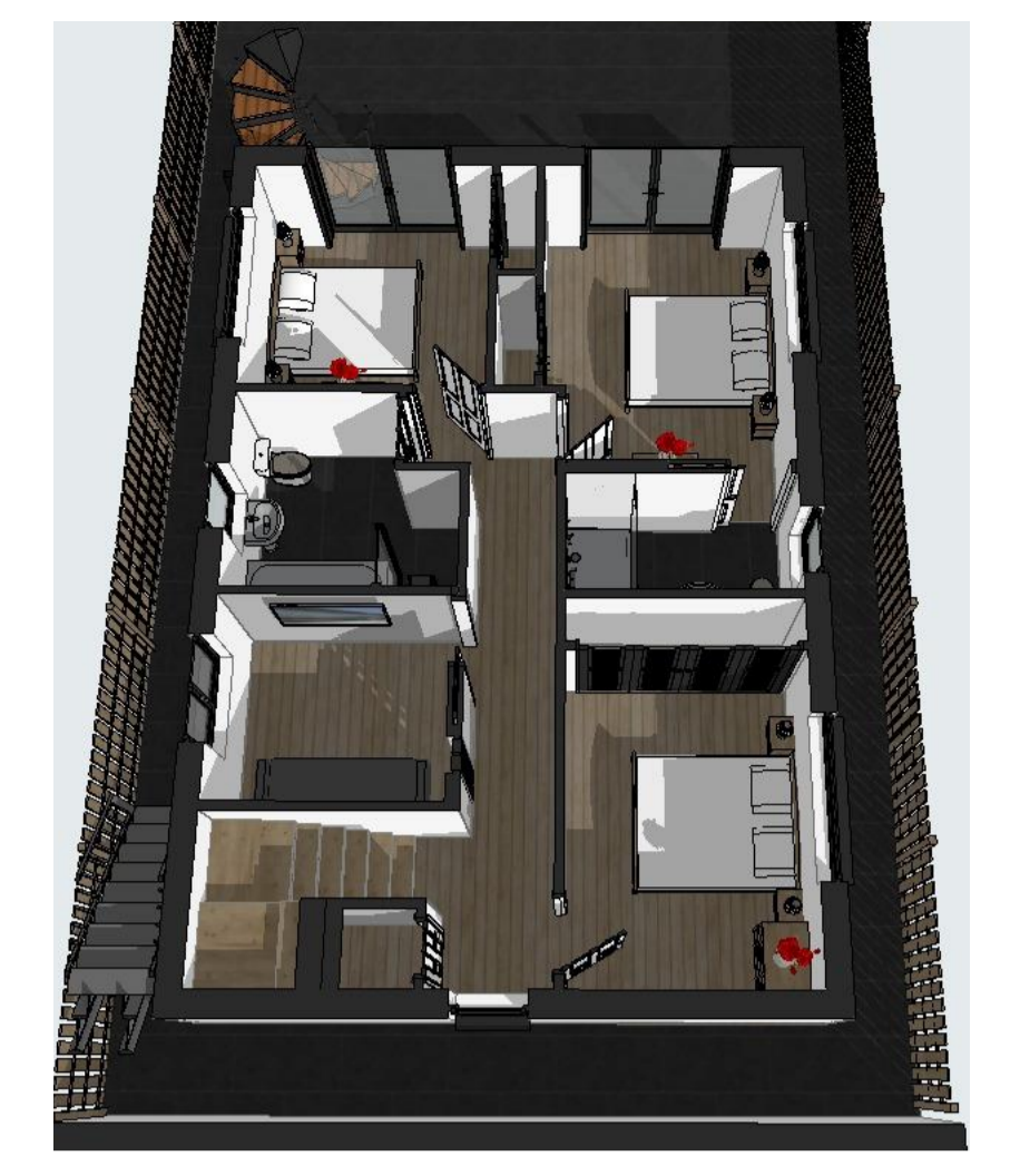
Generic Perspective (15):200