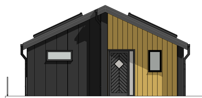
NW North West Elevation 1:100