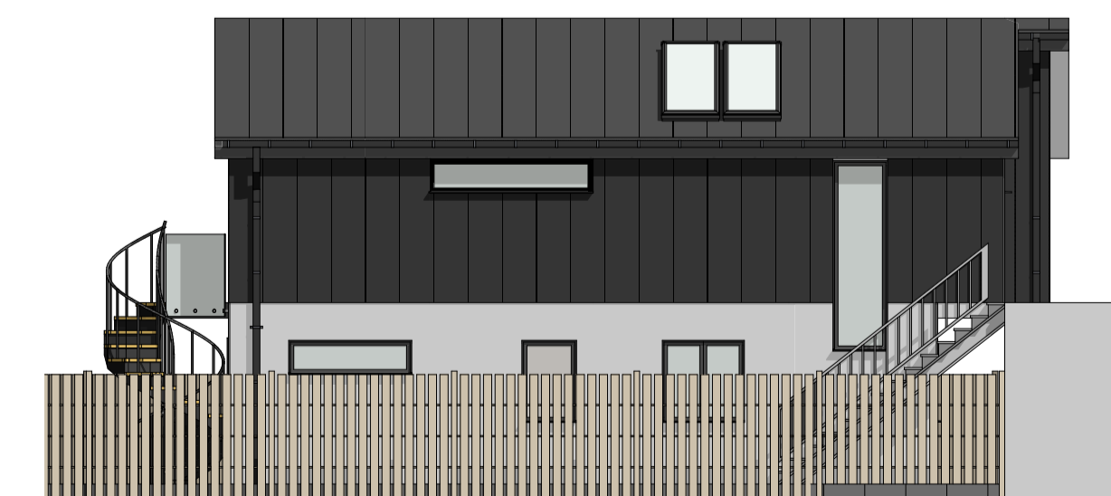
NE North East Elevation 1:100