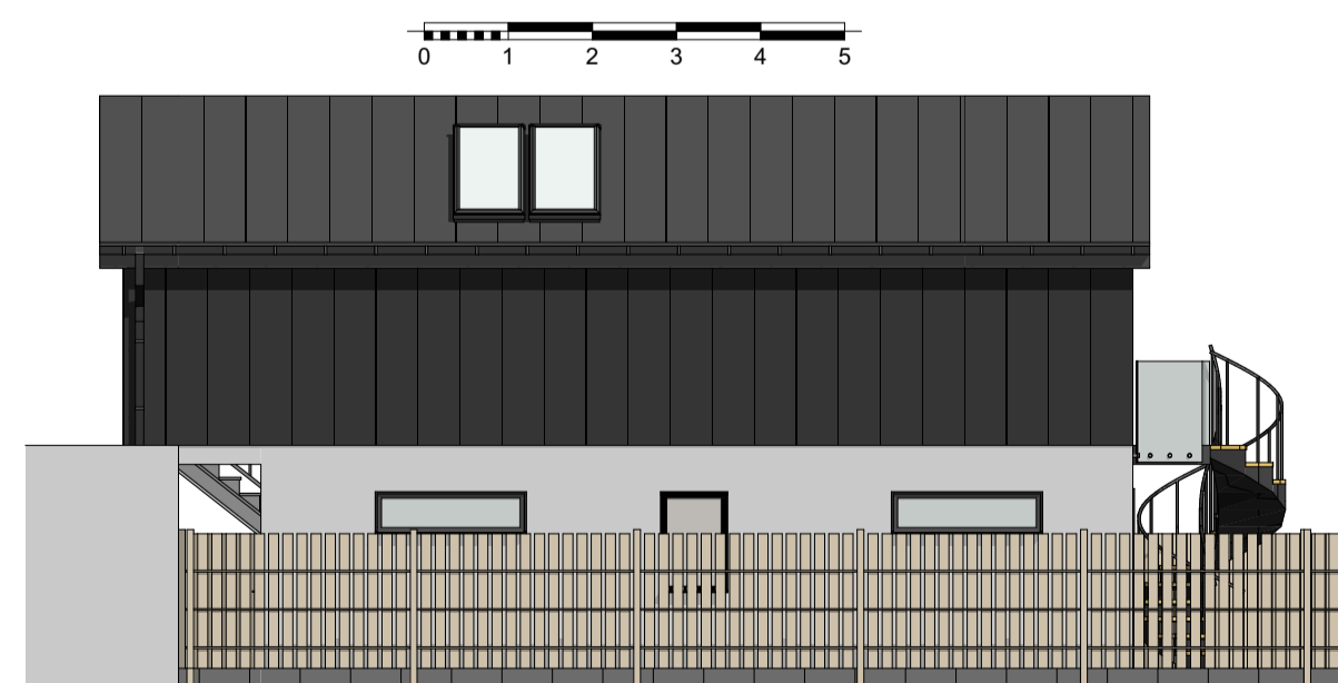
SW South West Elevation 1:100