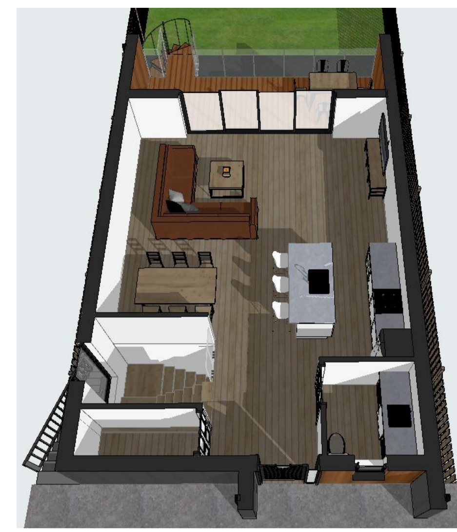
Generic Perspective (14) 1:200