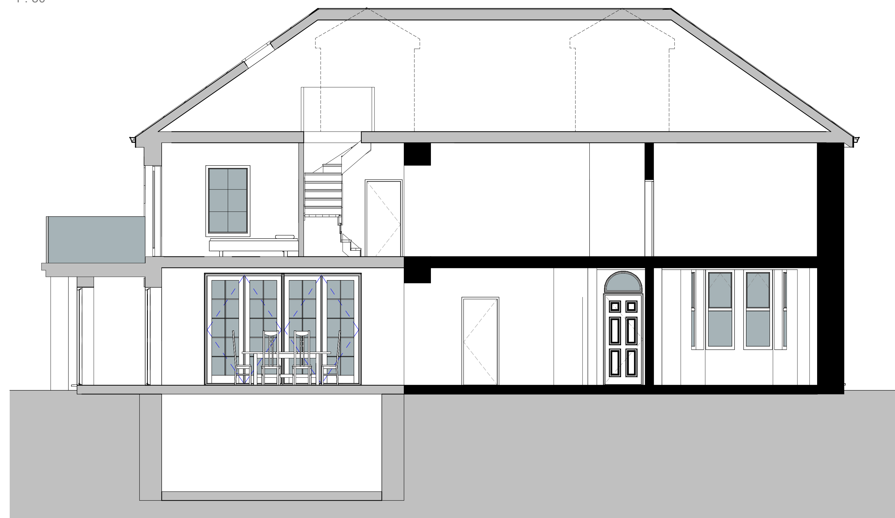
Typical Section 1 : 50