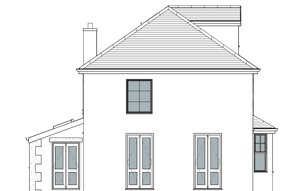
South Elevation 1 : 100

Proposed Materials: Walls - smooth render painted white with granite quoins & lintels Windows - white tbc Roof Lights - Conservation style Roof - Natural slate