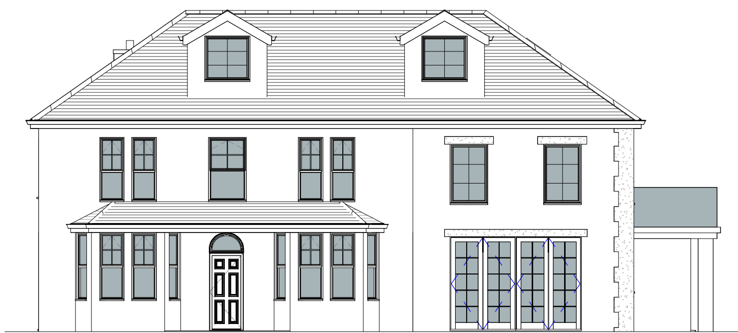
East Elevation 1 : 100

NOTES: (C) Any unauthorised use, reproduction or distribution of the document or it's contents will constitute an infringement of copyright. This document is to be read in conjunction with all other relevant information. Any discrepancies noted are to be raised as soon as possible. Do not scale from this drawing for construction purposes. 0m 1.0 2.0 3.0 4.0 5.0 6.0 Scale Bar 1:50 0m 1.0 2.0 3.0 4.0 5.0 6.0 Scale Bar 1:100