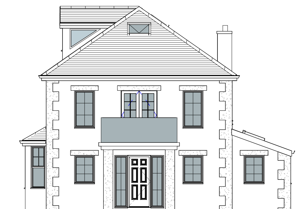
North Elevation 1 : 100