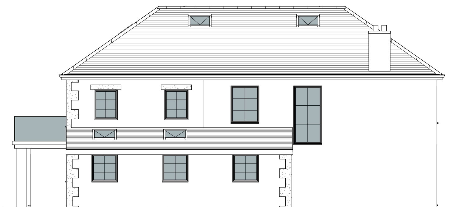
West Elevation 1 : 100