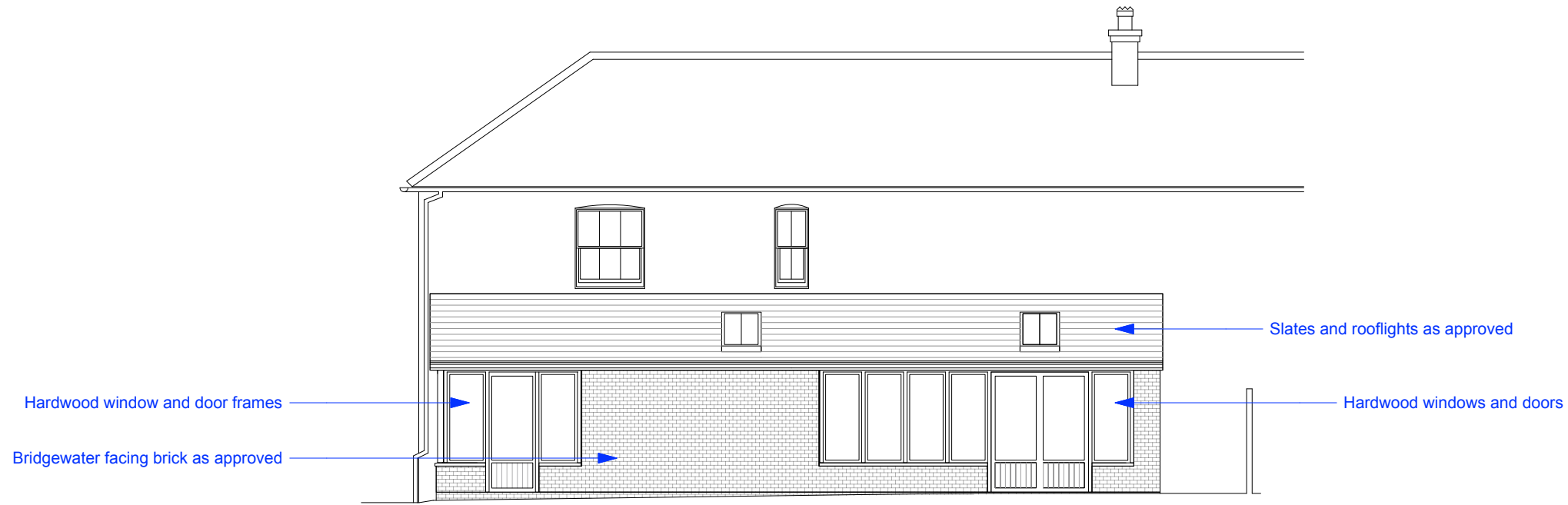
Proposed East Elevation 1:100