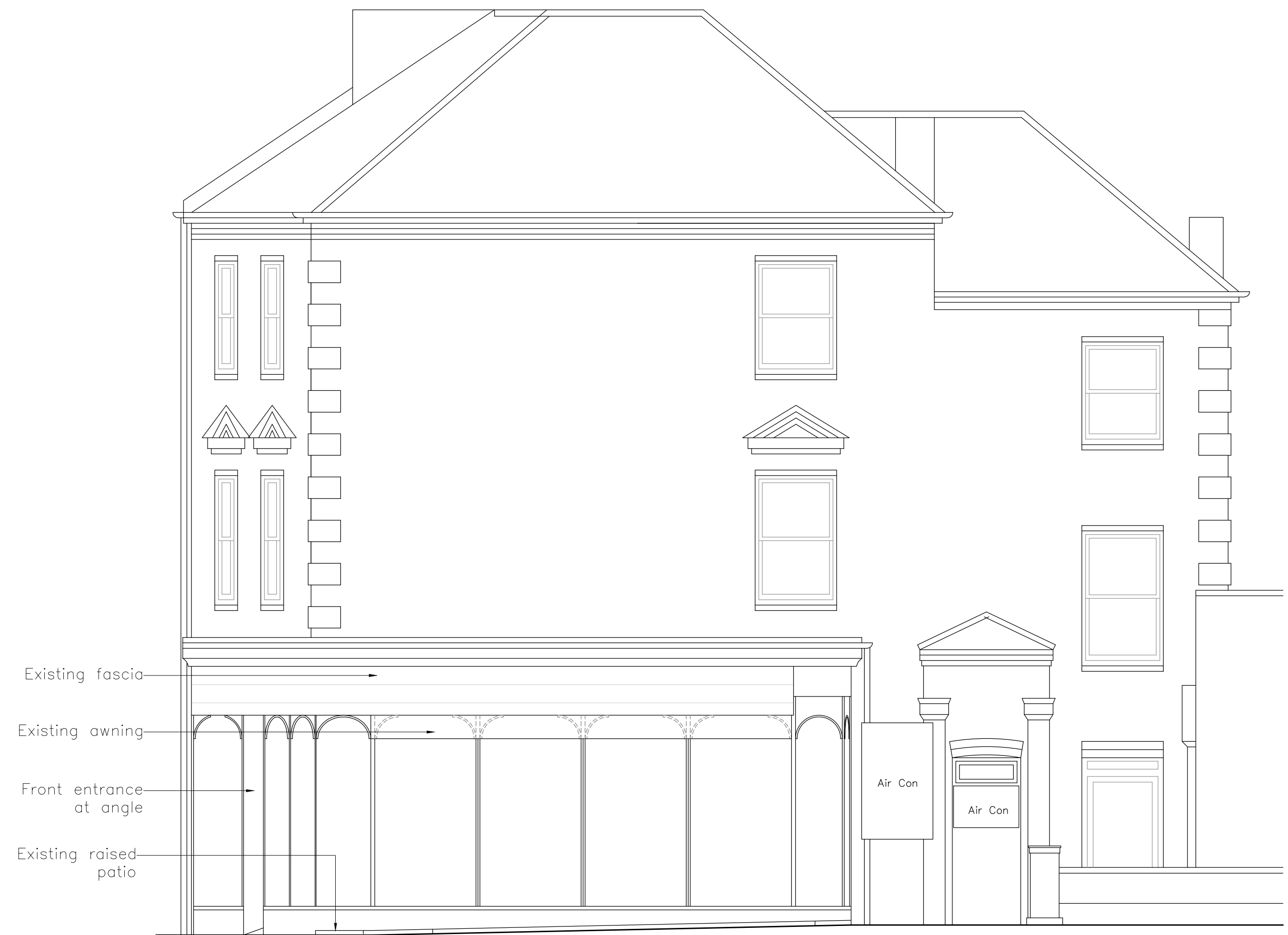
WEST ELEVATION (SIDE) SCALE 1:50