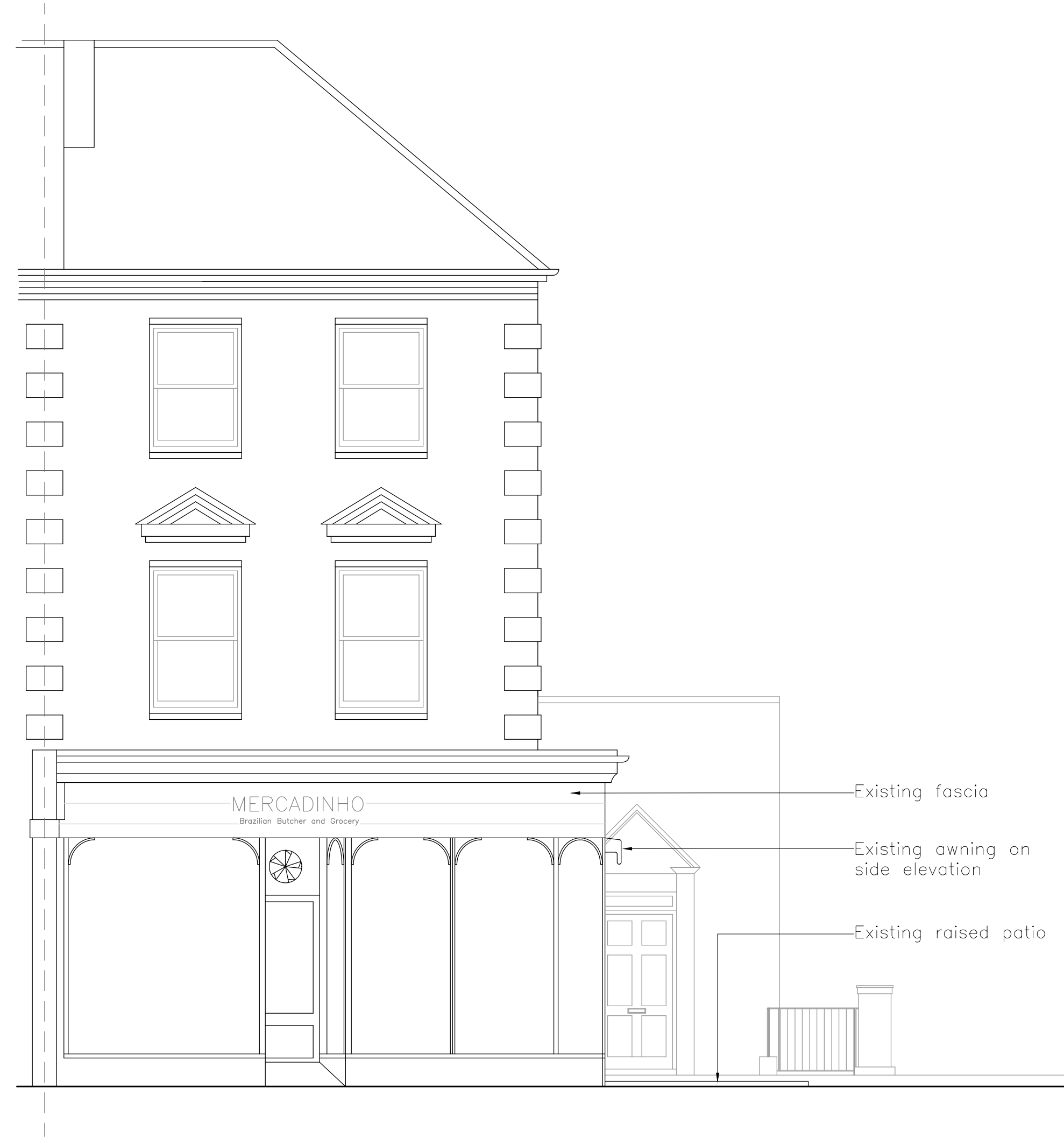
NORTH ELEVATION (FRONT) SCALE 1:50