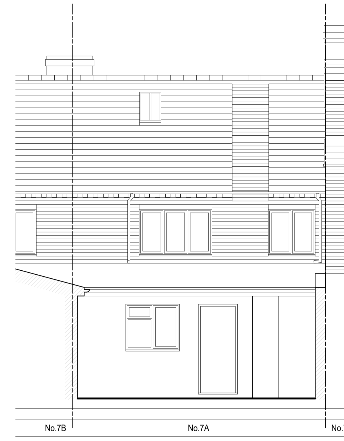
EXISTING REAR ELEVATION scale 1:50