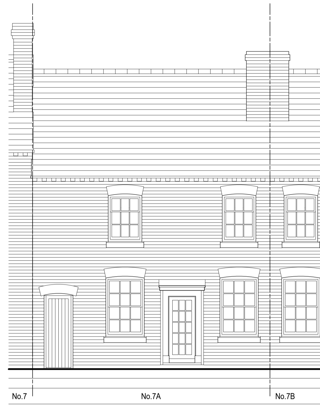
EXISTING FRONT ELEVATION scale 1:50