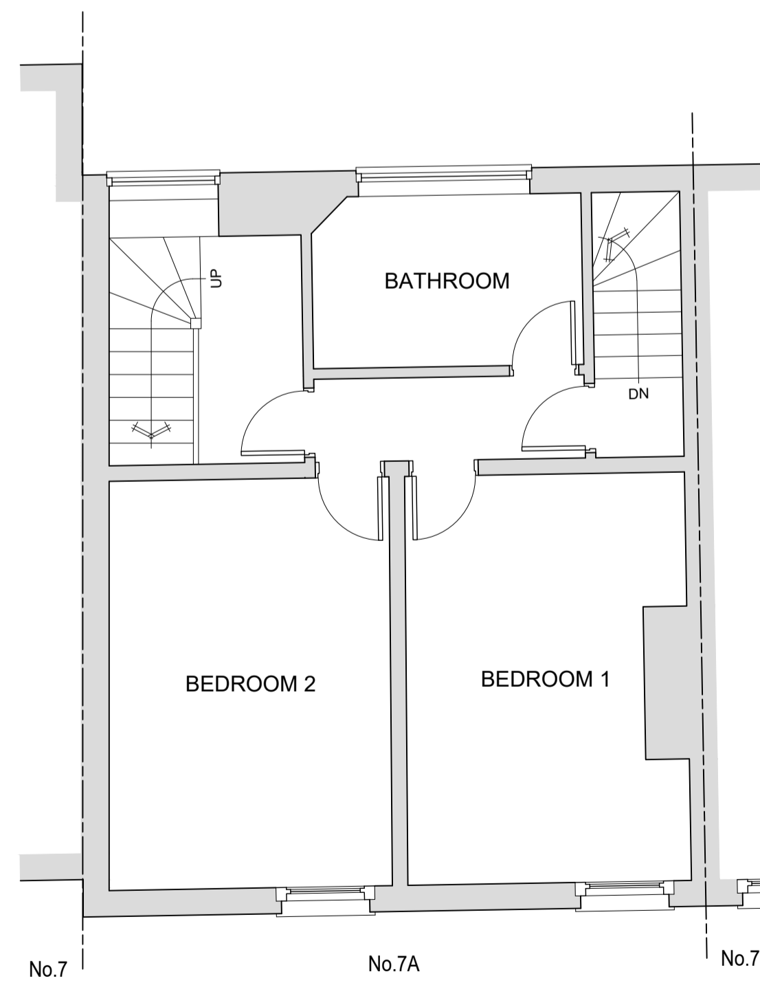
EXISTING FIRST FLOOR PLAN scale 1:50