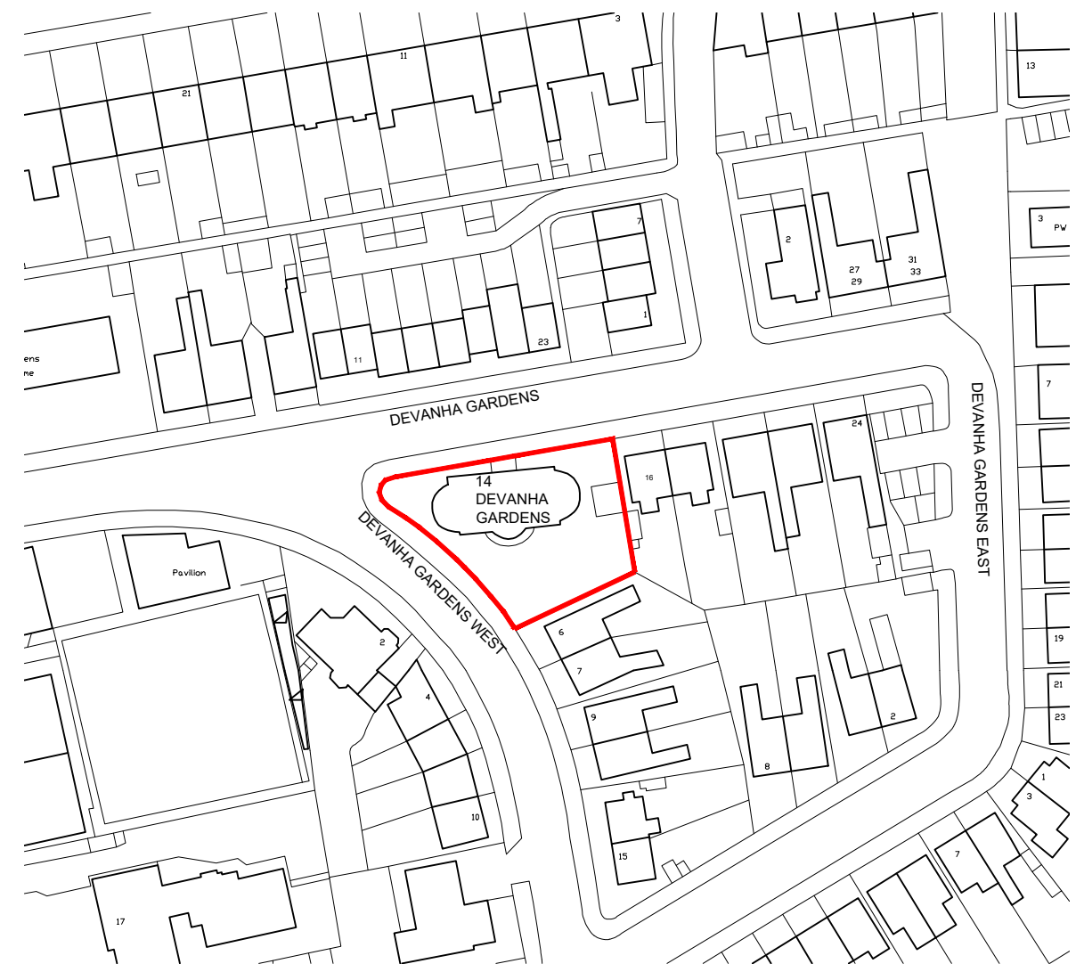
LOCATION PLAN 1:1250 0 50m