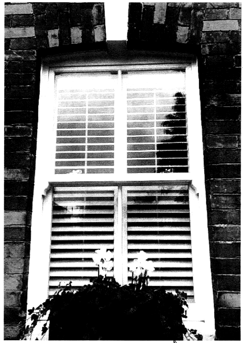
image of slim framed upvc window system to be replicated for replacement windows.