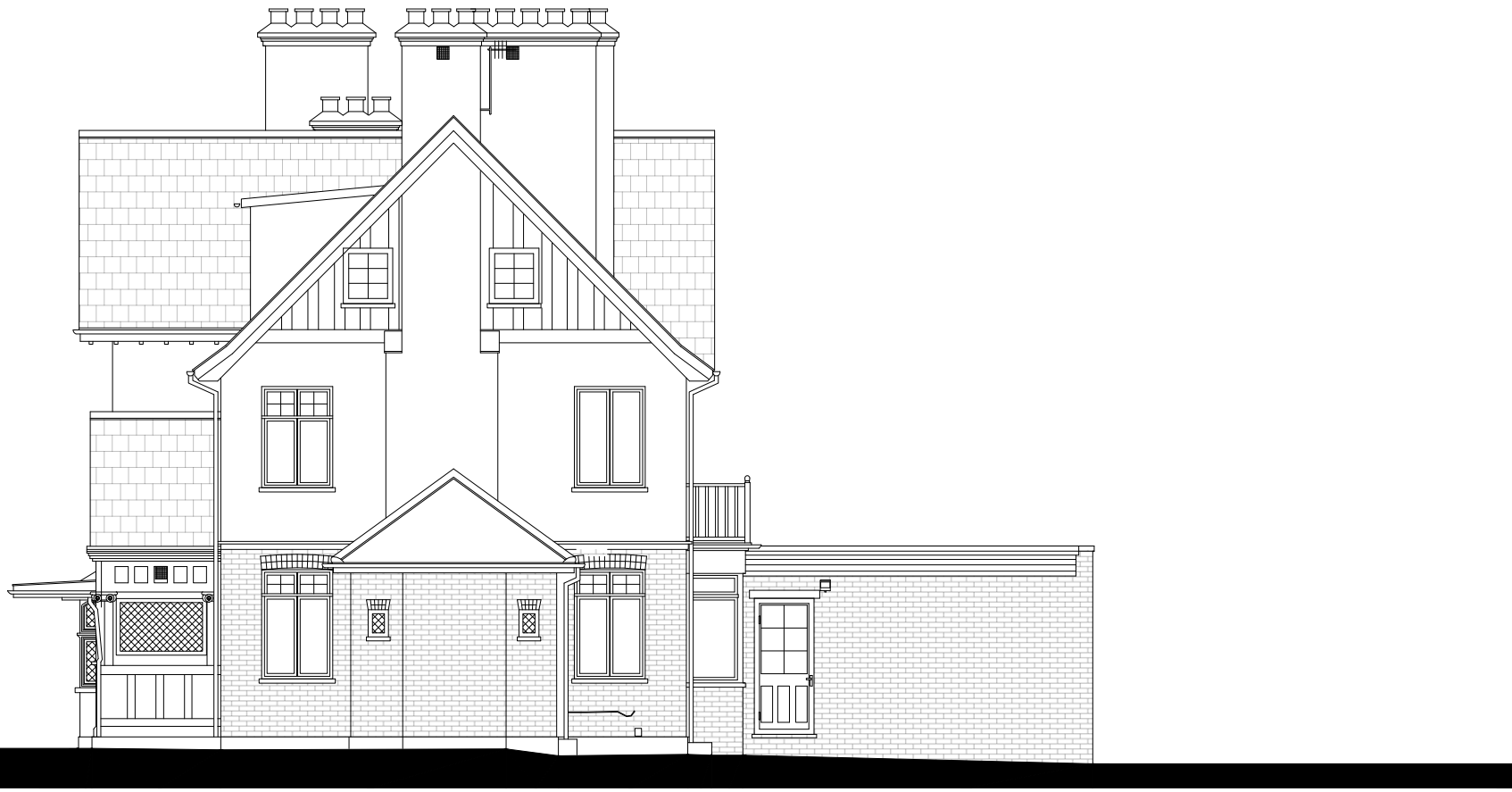
Existing Side elevation 1:100