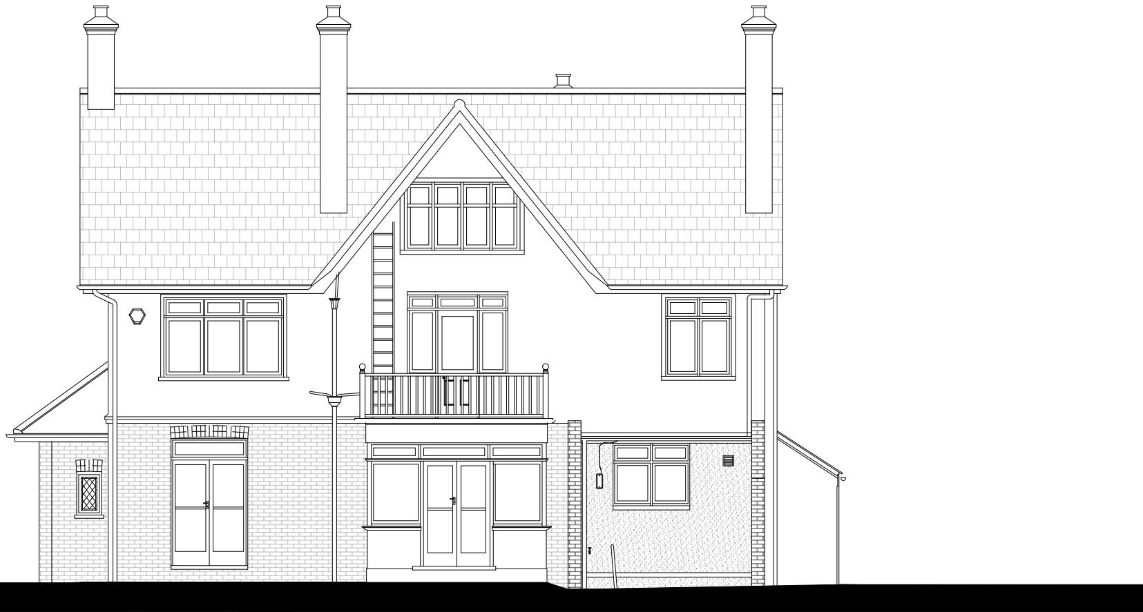
Existing Rear elevation 1:100

This drawing is protected under Copyright and at no time should any portion of this drawing be reproduced or copied without the permission of the Architect. (Design Copyright Act 1968) This drawings must not be used for purposes other than that for which it is provided. It is supplied without liability for any errors or omissions. Drawings only to be scaled for planning application purposes, all dimensions to be checked on site. All drawings subject to Statutory Authority Approval.