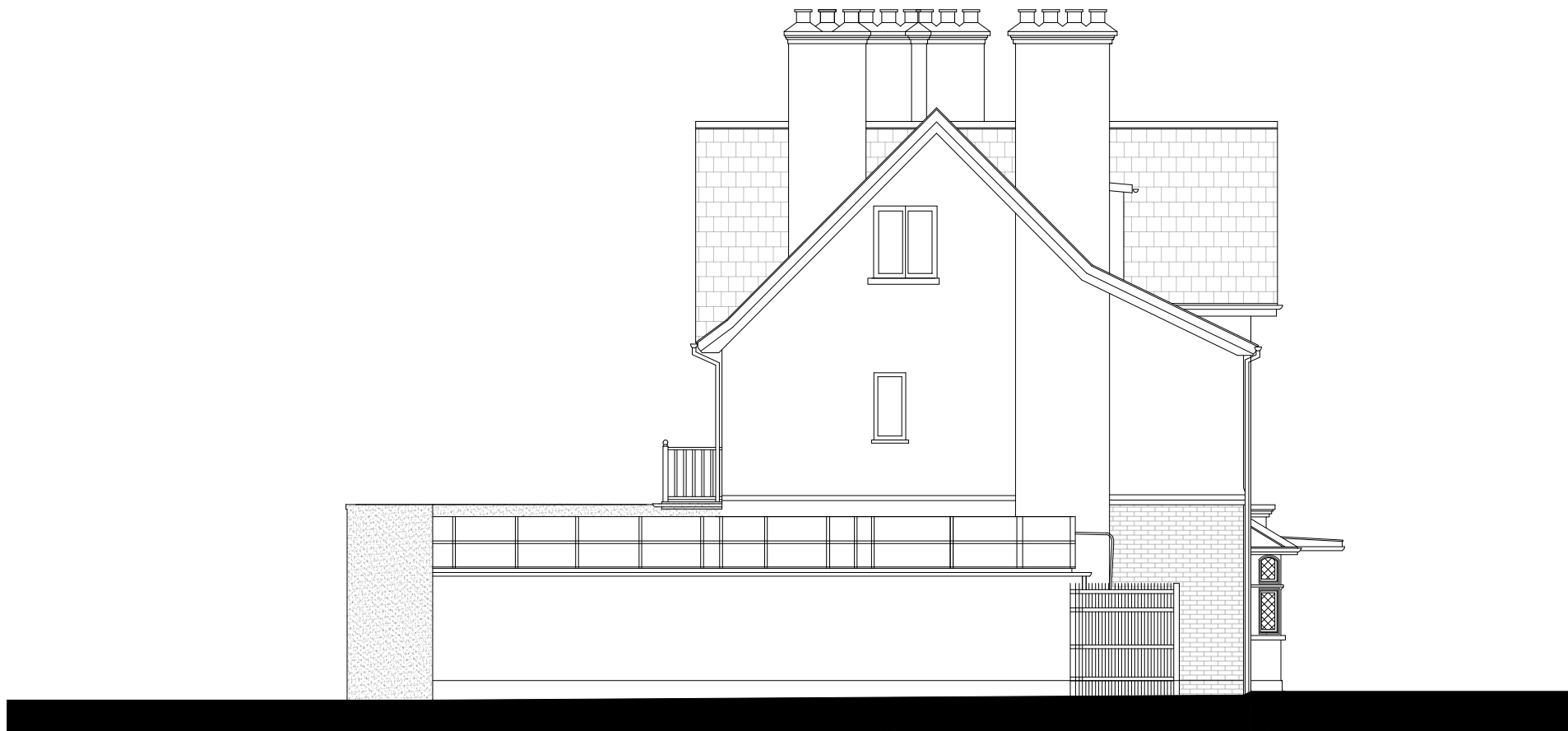
Existing Side elevation 1:100

This drawing is protected under Copyright and at no time should any portion of this drawing be reproduced or copied without the permission of the Architect. (Design Copyright Act 1968) This drawings must not be used for purposes other than that for which it is provided. It is supplied without liability for any errors or omissions. Drawings only to be scaled for planning application purposes, all dimensions to be checked on site. All drawings subject to Statutory Authority Approval.