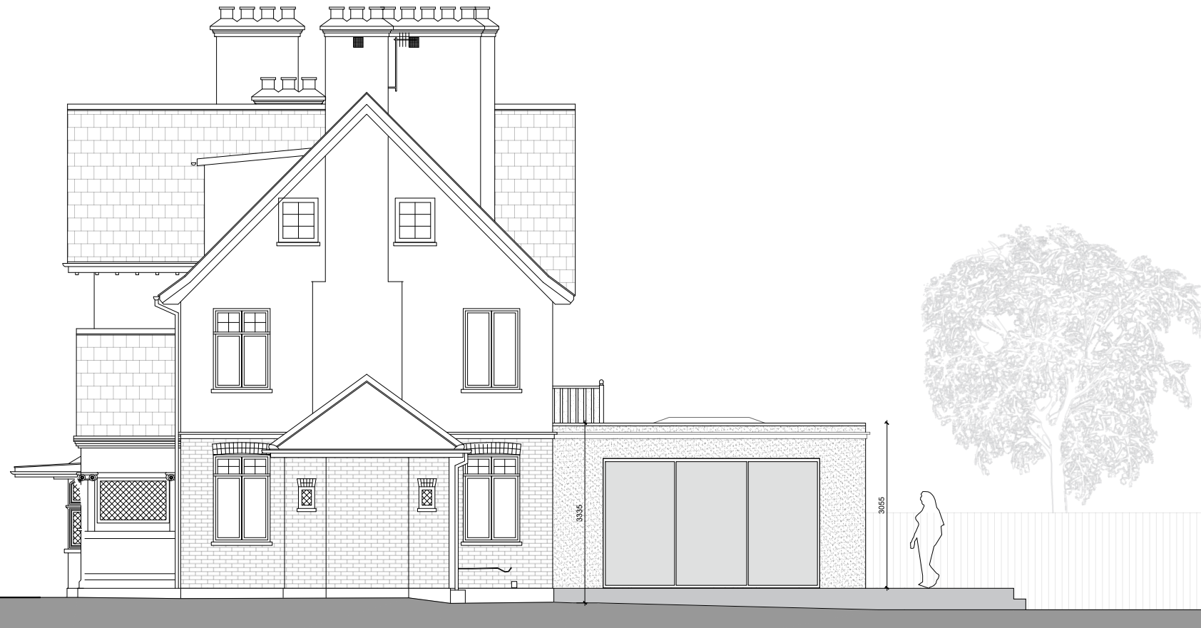
Proposed Side elevation 1:100