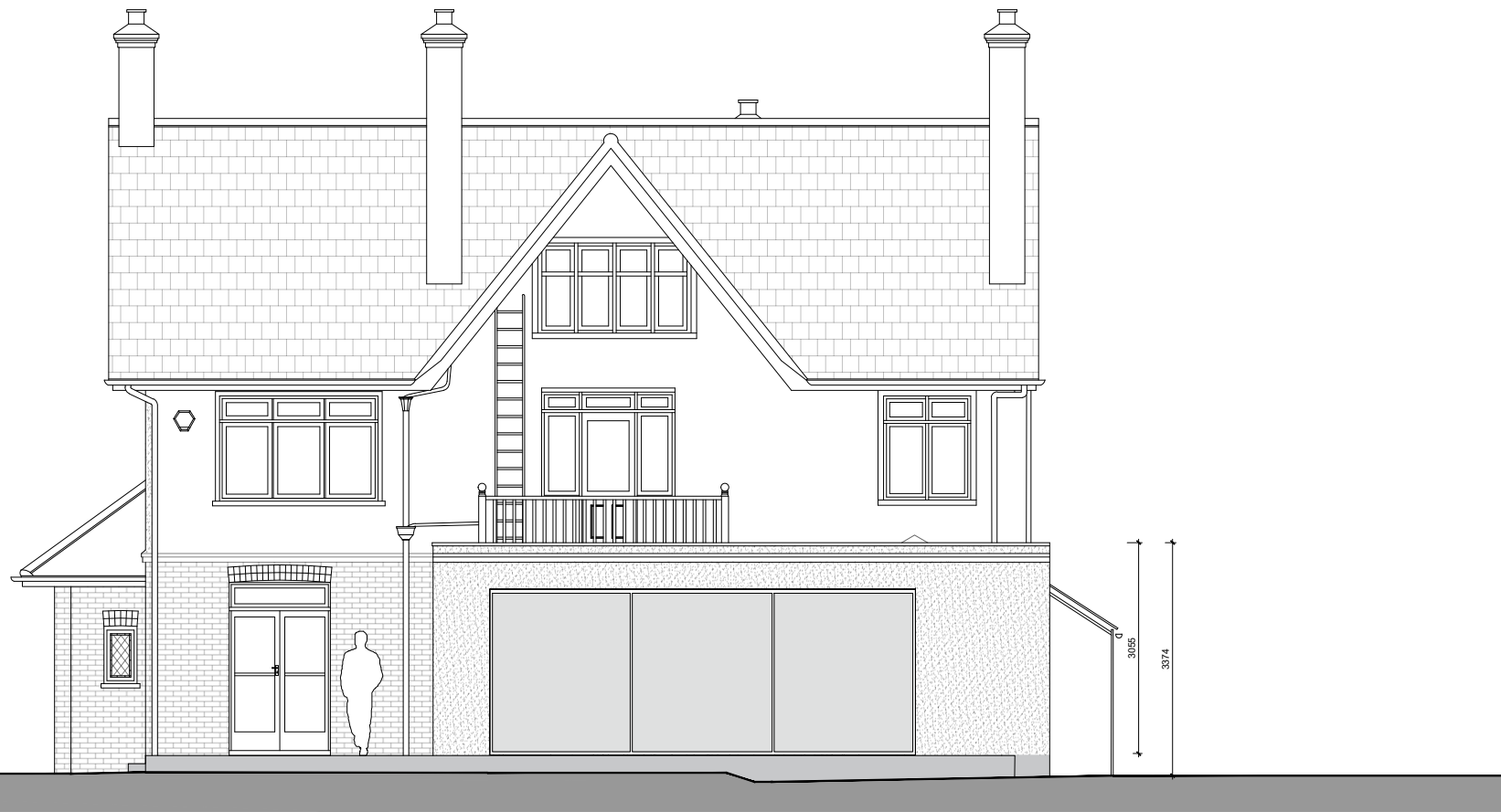
Proposed Rear elevation 1:100

This drawing is protected under Copyright and at no time should any portion of this drawing be reproduced or copied without the permission of the Architect. (Design Copyright Act 1968) This drawings must not be used for purposes other than that for which it is provided. It is supplied without liability for any errors or omissions. Drawings only to be scaled for planning application purposes, all dimensions to be checked on site. All drawings subject to Statutory Authority Approval.