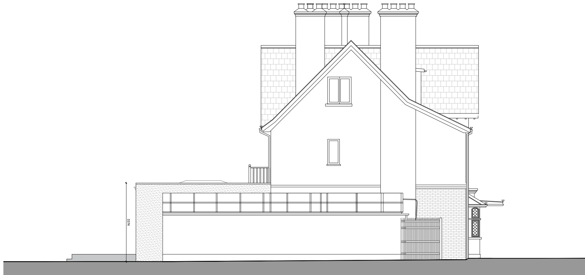
Proposed Side elevation 1:100

This drawing is protected under Copyright and at no time should any portion of this drawing be reproduced or copied without the permission of the Architect. (Design Copyright Act 1968) This drawings must not be used for purposes other than that for which it is provided. It is supplied without liability for any errors or omissions. Drawings only to be scaled for planning application purposes, all dimensions to be checked on site. All drawings subject to Statutory Authority Approval.