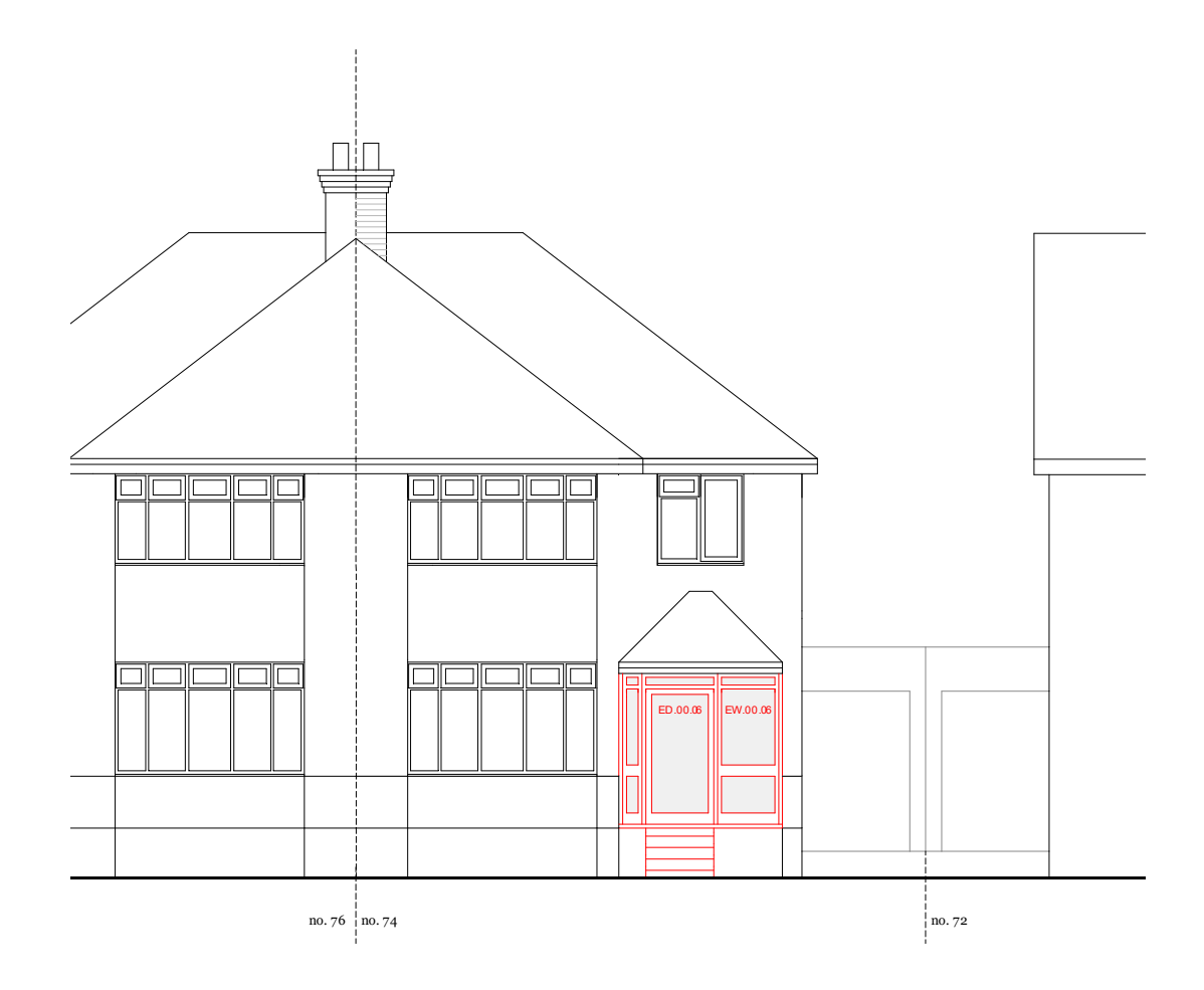
Front ⊟evation (West)