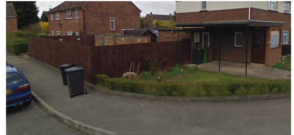
Photo of No. 23 Chaucer Road (opposite side of cul-de-sac, facing No. 9). The recently-installed fence at No. 9 is similar in style and proportion to the existing fence at No. 23