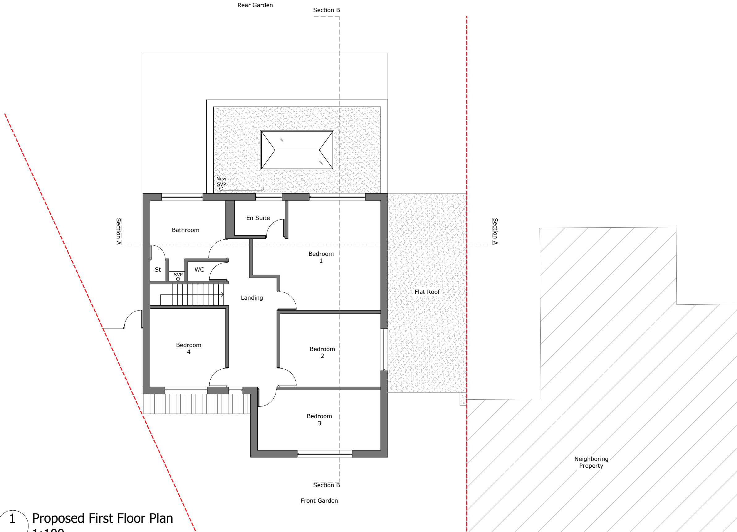
1 Proposed First Floor Plan 1:100