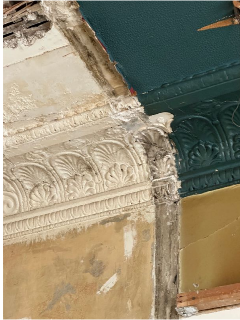
Zone 2: Bedroom, Hall and Kitchen Existing Cornice retained above dropped ceiling. Condition generally good but some minor repairs needed