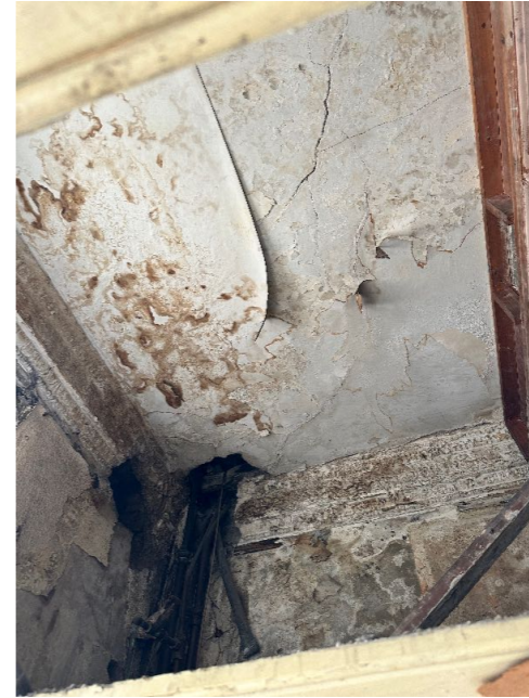
Zone 4: Bathroom Existing cornice exposed above dropped ceiling. Serious state of disrepair and can not be repaired. Cornice to be replaced with matching one.