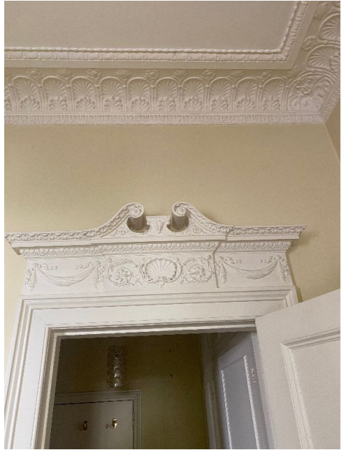
Zone 1: Principal Room Existing Cornice retained in good condition.