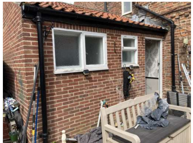
VIEW 8 (Ground Floor Extension windows)