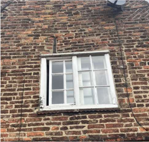
VIEW 5 (First Floor Rear sash window)