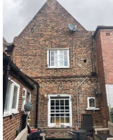
VIEW 2 (58 Flemingate Rear)