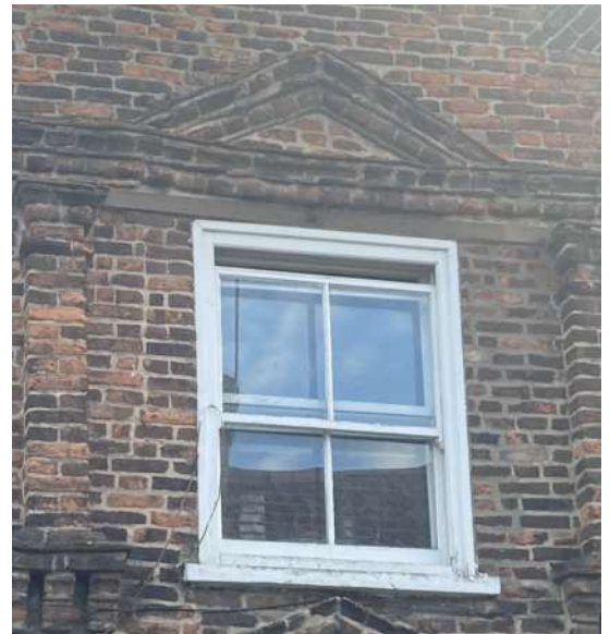
VIEW 4 (Front First floor window)