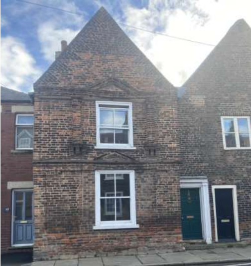
VIEW 1 (58 Flemingate)