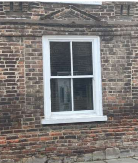
VIEW 3 (Front Ground Floor Window)