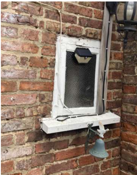
VIEW 7 (Ground floor fixed window)