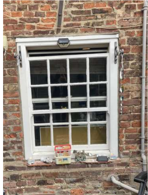
VIEW 6 (Ground Floor Rear sash window)