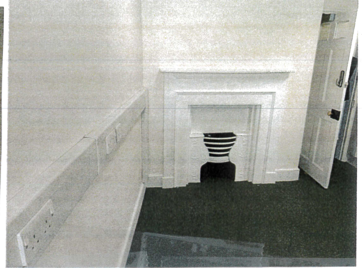
7. Georgian Fireplace surgery 10, doorway to right to be retained. Modern partition to left if chimney breast to be realigned