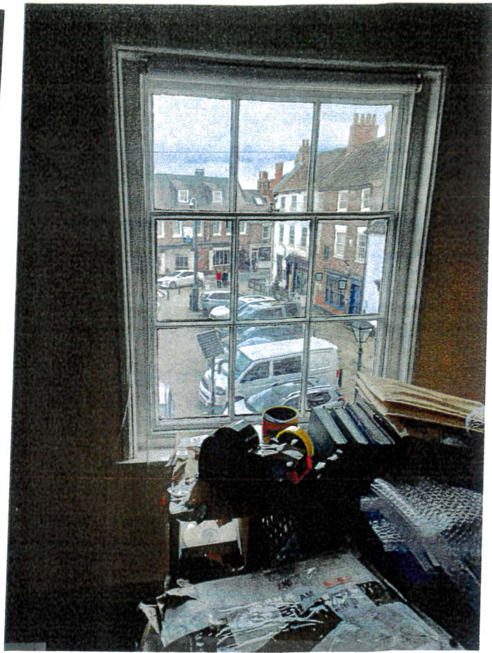
second floor front window no 28 from S12