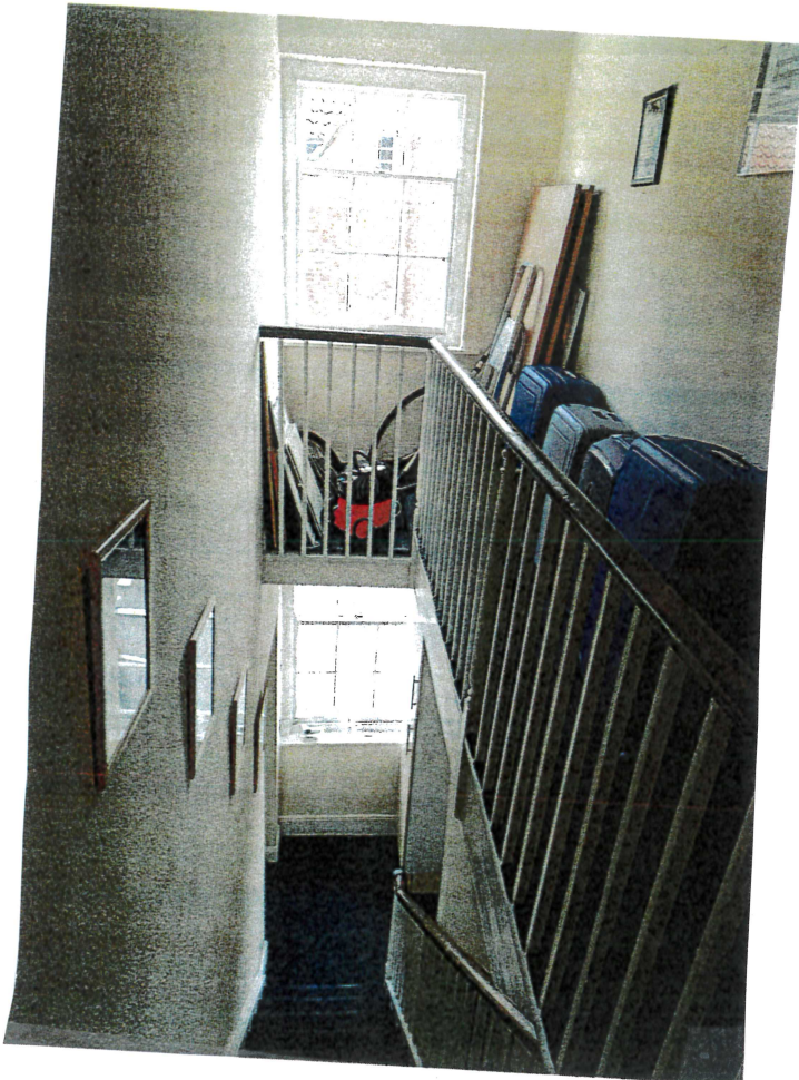
second floor landing no 18, looking down to first floor .Staircases retained, partition to right both first and second floors to be relocated to provide wider waiting area.