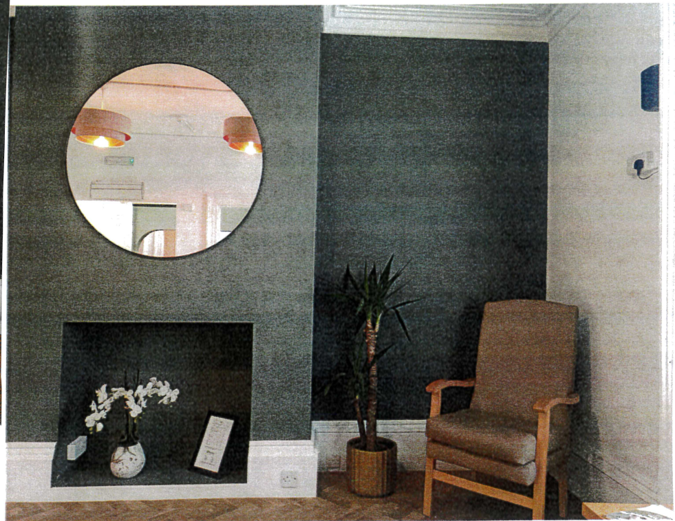
2 and 3 The present chimney breast against the party wall 17/18, with no surviving fireplace or surround . New borrowed light to left of chimney breast into reception in no 18 and new opening with ramp within up from entrance in no 18 beyond.