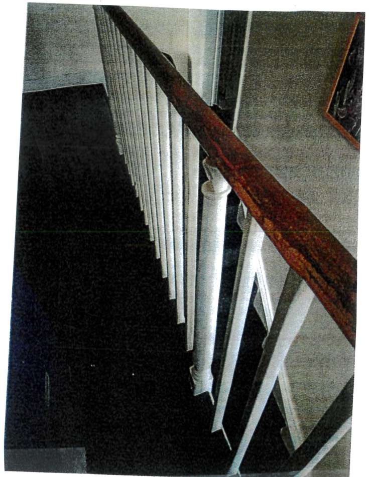
close up, second floor landing of no 18; balustrade with intermediate newel, to be retained .Doorway to far left to be relocated, to be served by existing landing return