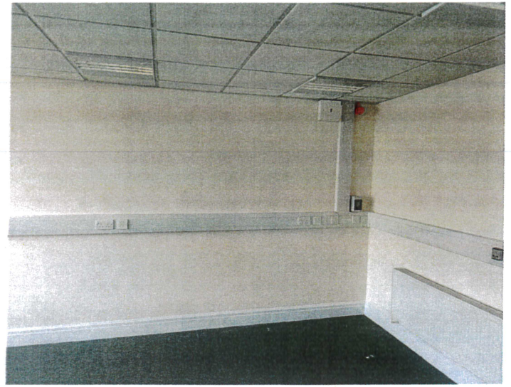
3. Ground Floor no 18 ; party wall to no 17, site of new opening for rambled access to Waiting area in no 17