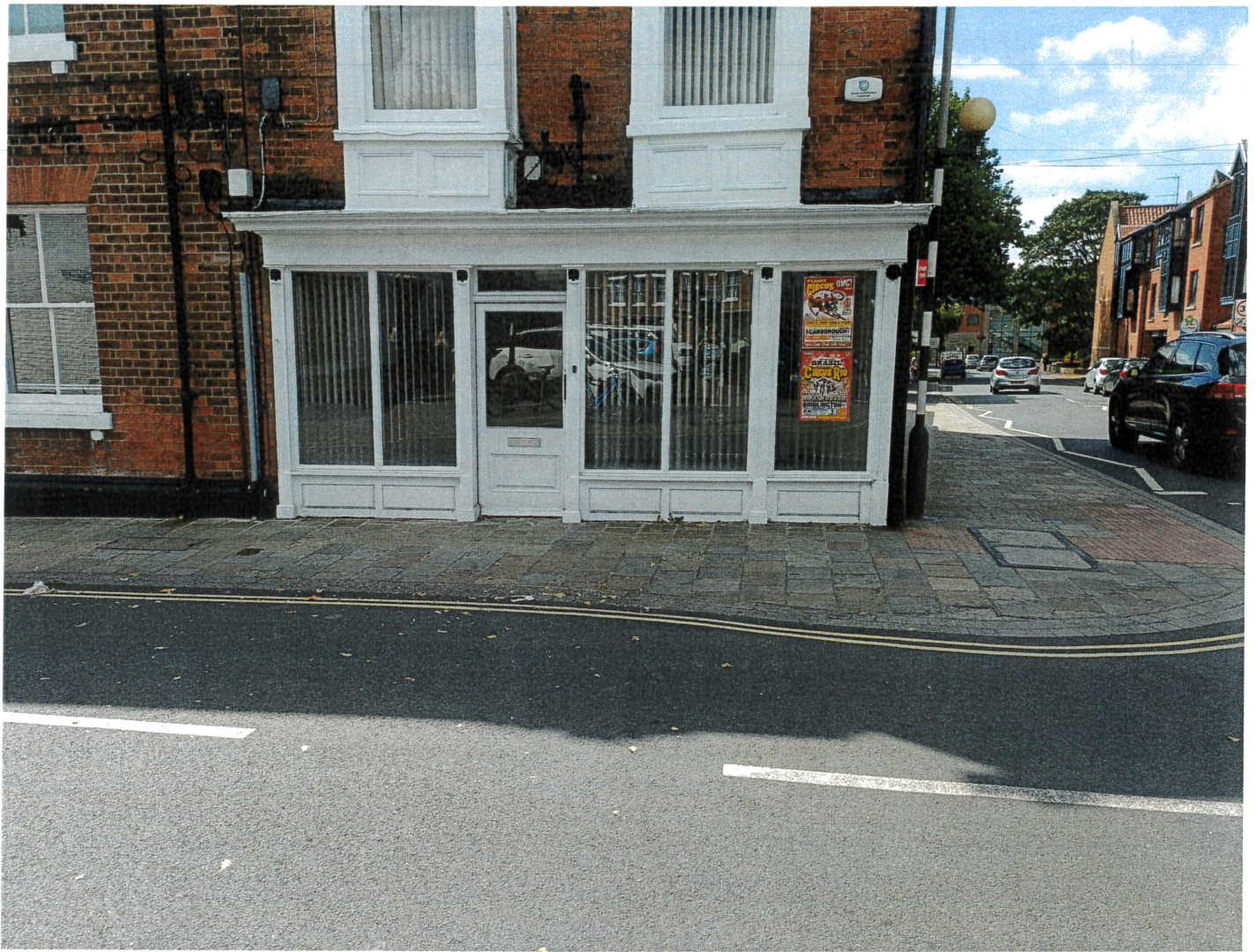
Close up photos show door and shopfront August 2023.