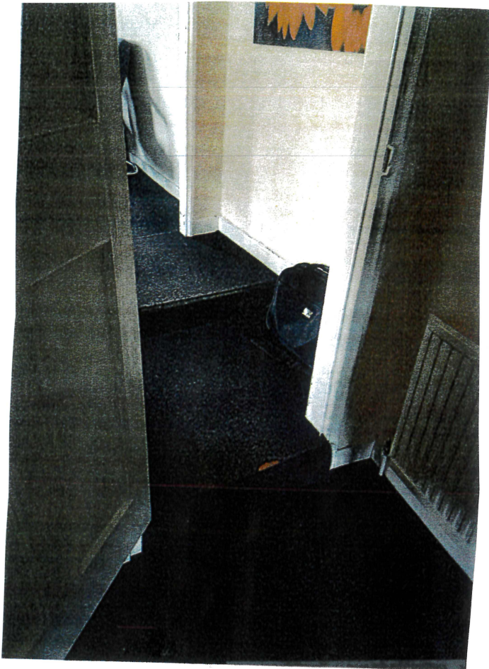
Second floor no 18, looking from surgery S 11, doorway to be blocked and partition to landing beyond relocated leaving nib.