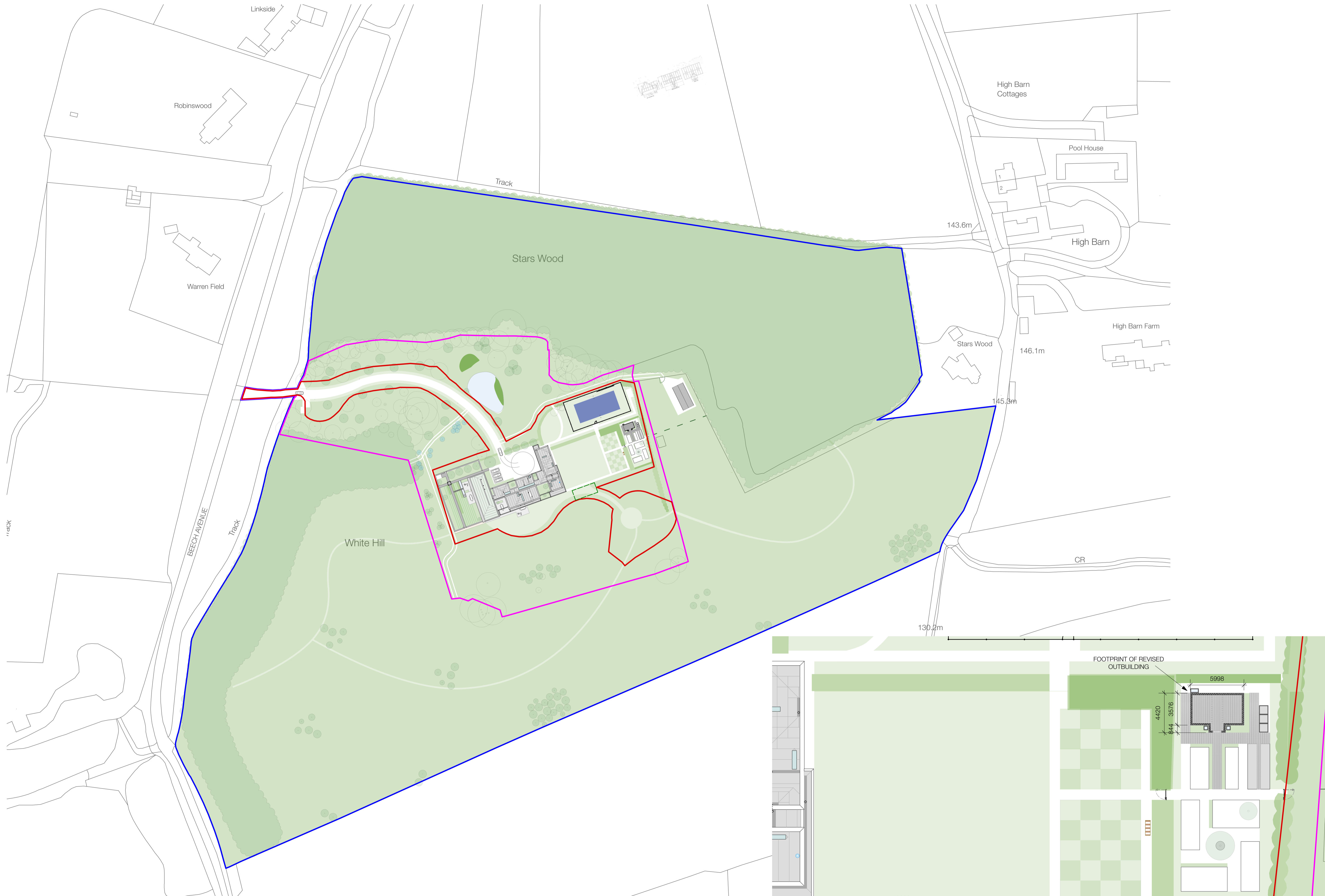
0 25 50 75 100 M SITE LOCATION PLAN SCALE 1:1000 @ A1

© john pardey architects • Do not Scale. Used figured dimensions only. • All dimensions to be checked on site. • All drawings to be read in conjunction with engineer's drawings. Any discrepancies between consultants drawings to be reported to the Architect before any work commences. • The Contractor's attention is drawn to the Health & Safety matters identified in the Health & Safety plan and on drawings as being potentially hazardous. • These items should not be considered as a full and final list. • The Work Package Contractor's normal Health & Safety obligations still apply when undertaking constructional operations both on and off site.