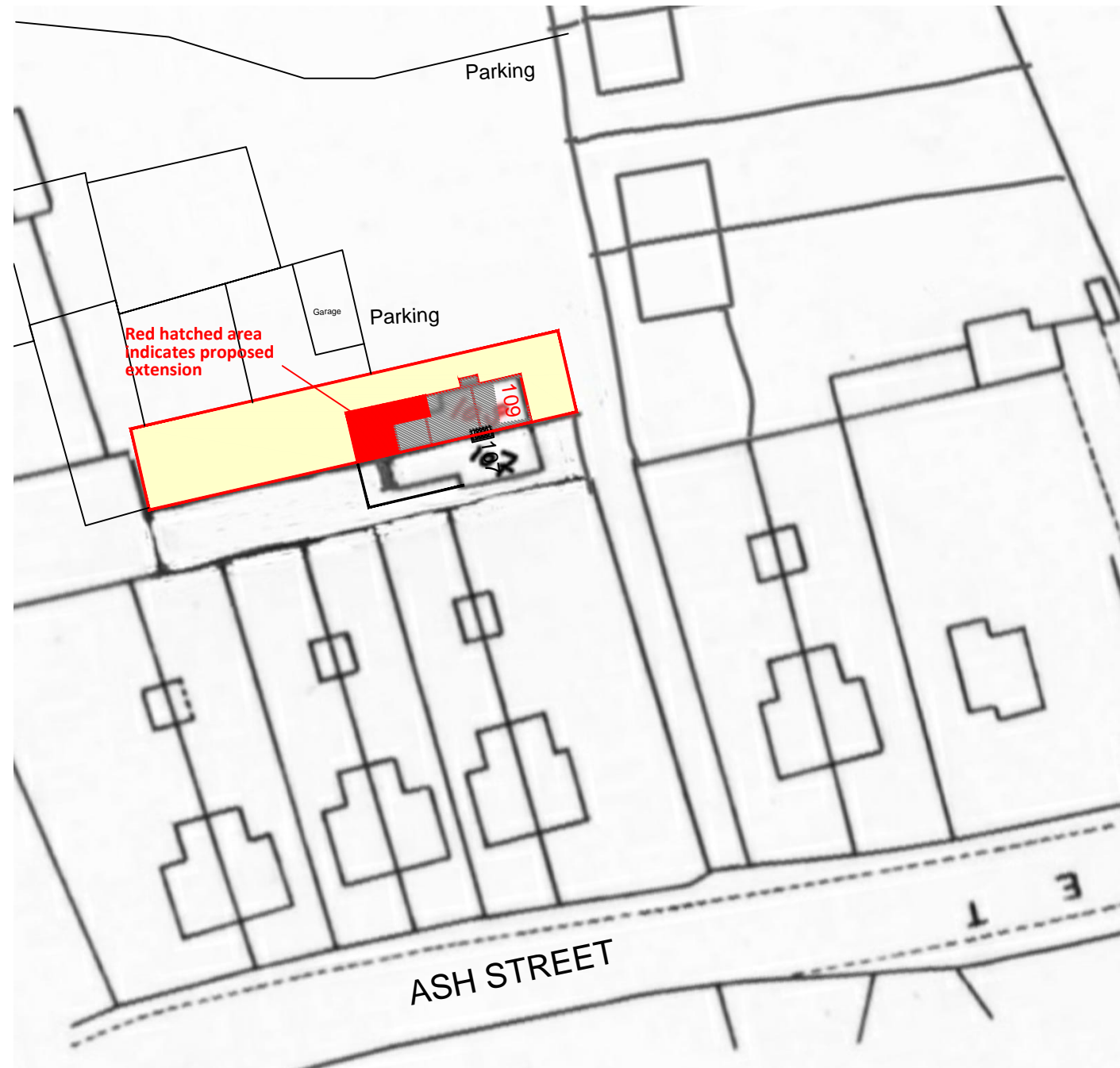
Block Plan Scale: 1:500