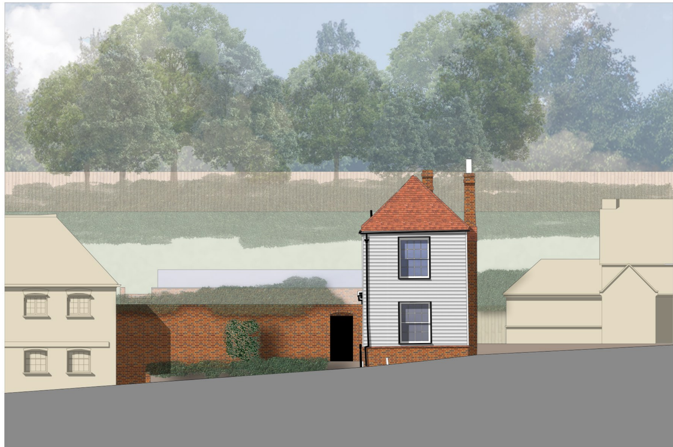
Proposed Elevation Along Church Hill