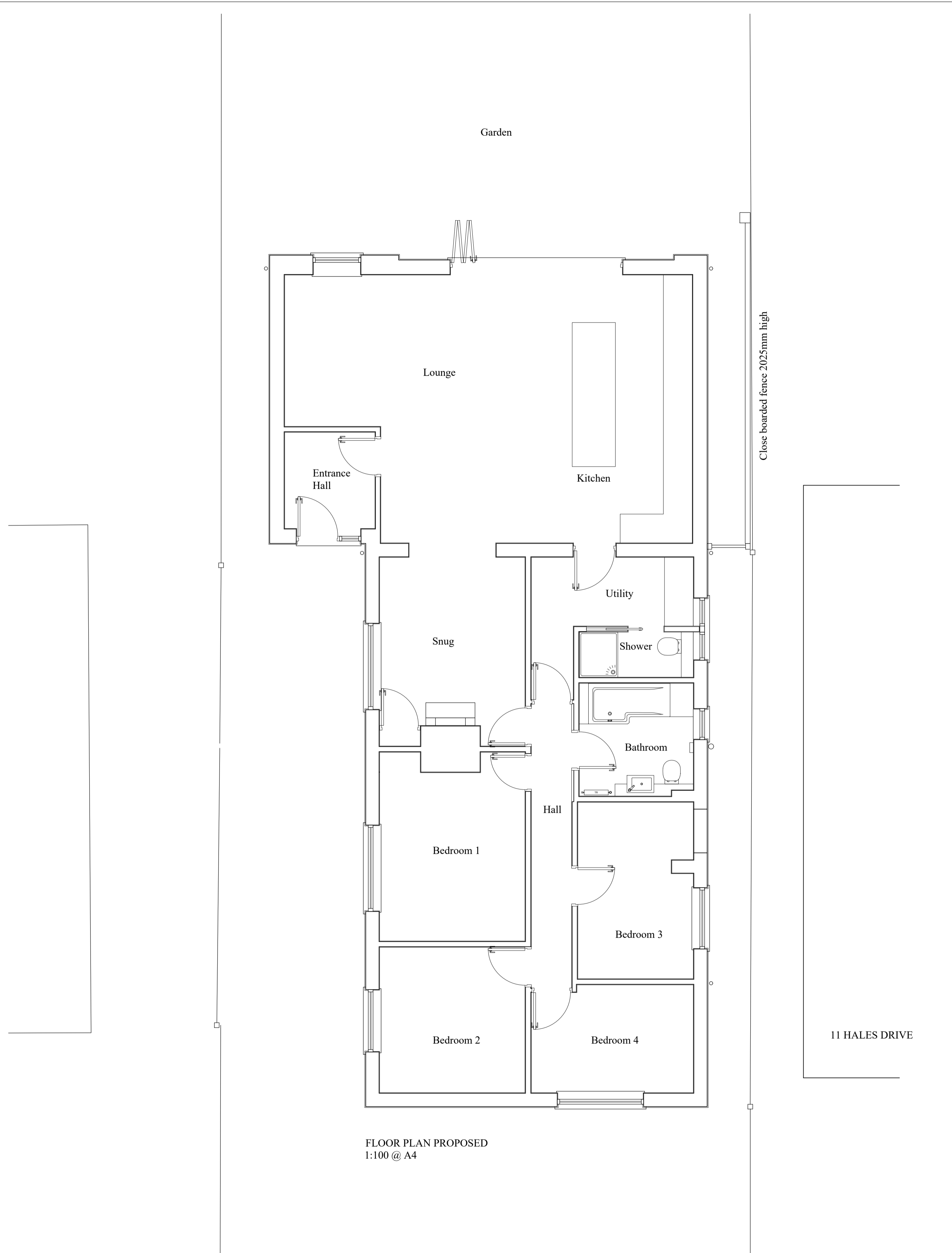
FLOOR PLAN PROPOSED 1:100 @ A4