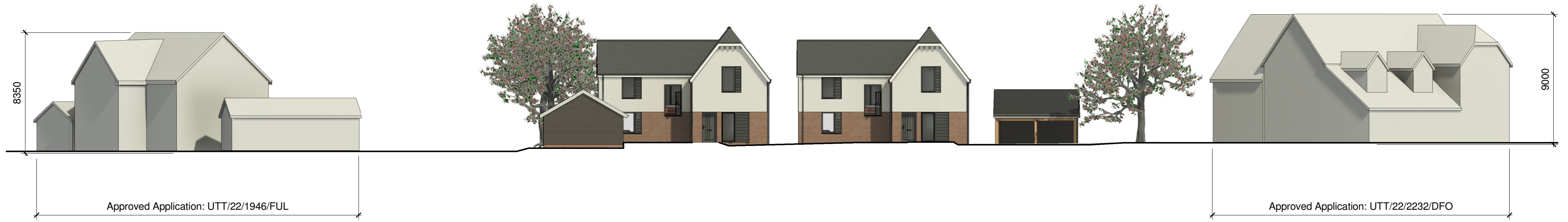
Site Section A-A 1 : 200