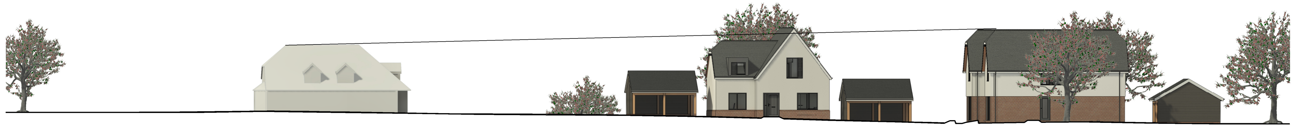
Site Section B-B 1 : 200