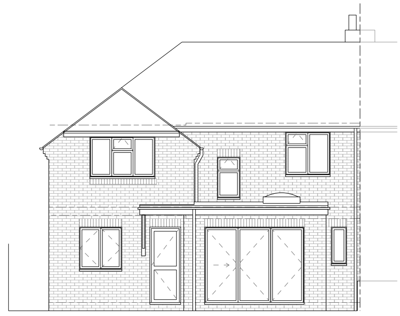
EXISTING REAR ELEVATION (S)