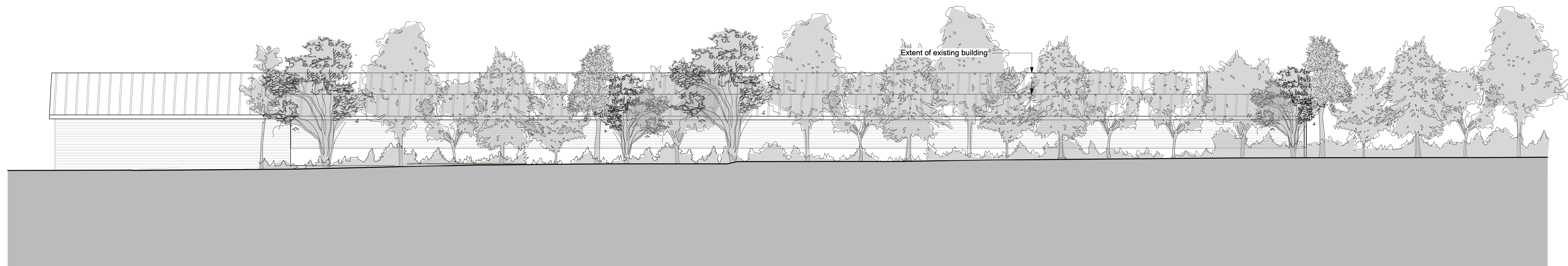
Existing North (street) Elevation - View from Flyfield Road

Key: - Existing ground level - Primary exit - Secondary exit