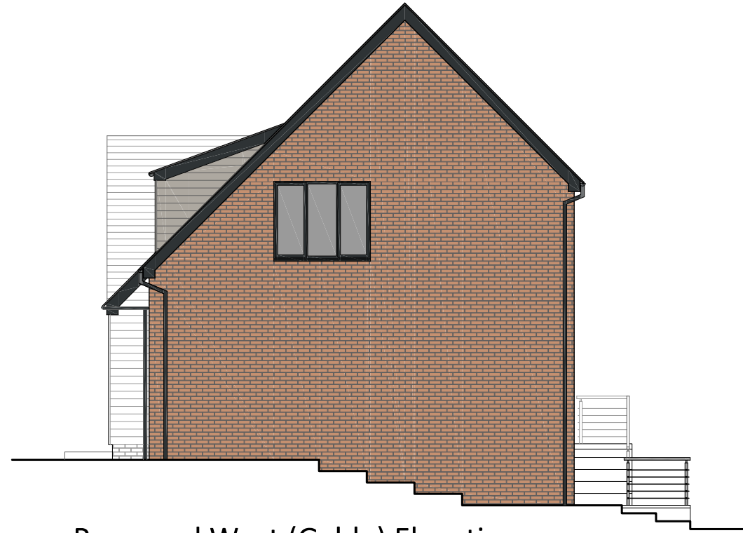
Proposed West (Gable) Elevation