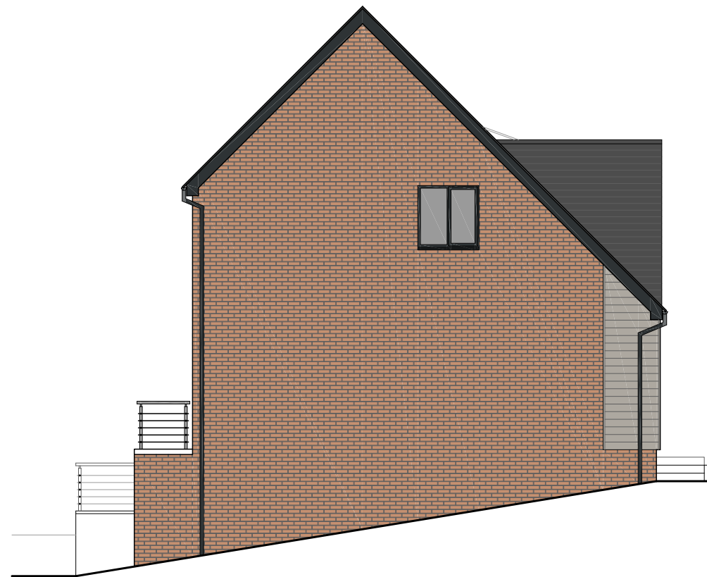
Proposed East (Gable) Elevation