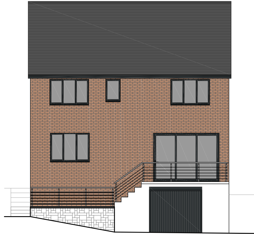
Proposed South (Rear) Elevation