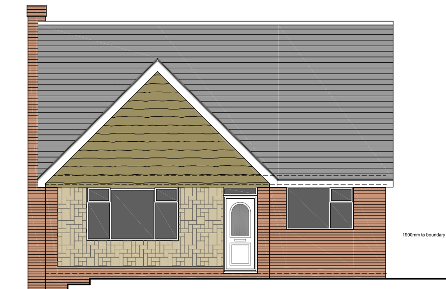
Front elevation to Summershades Lane (North)