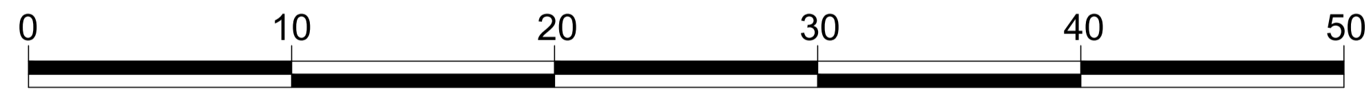
SCALE BAR 1:200