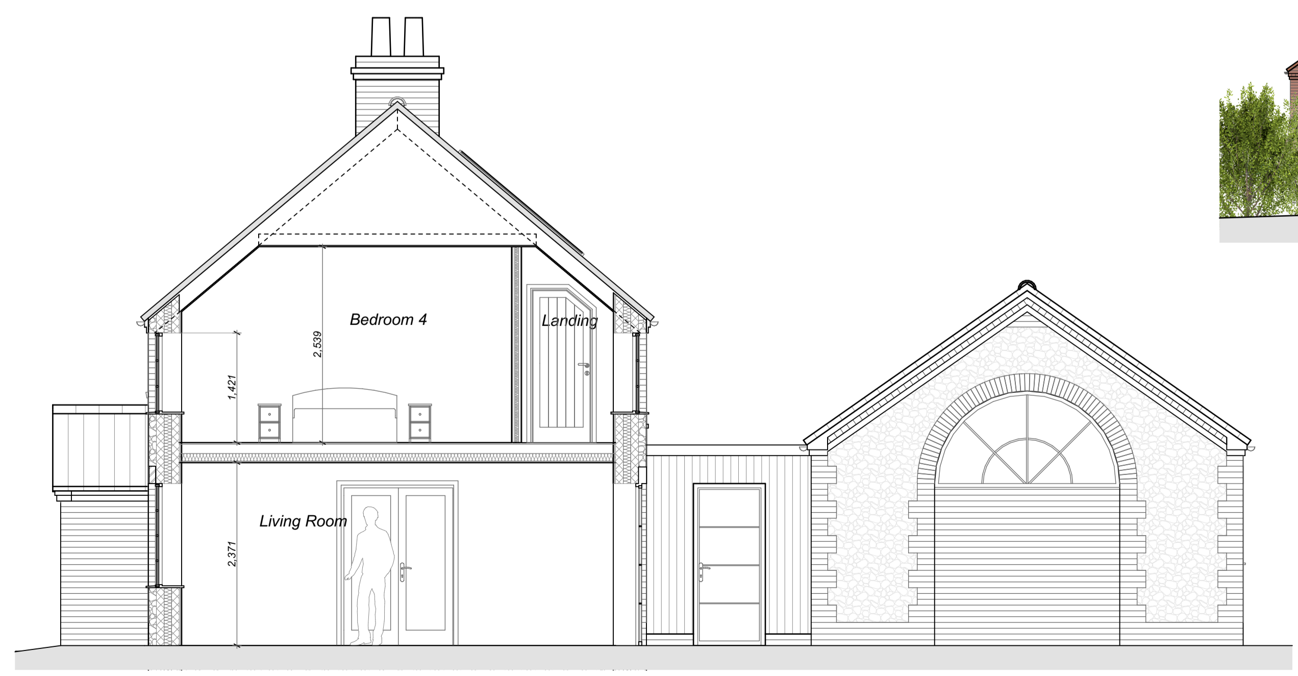
CHA — Section A - A 1:50