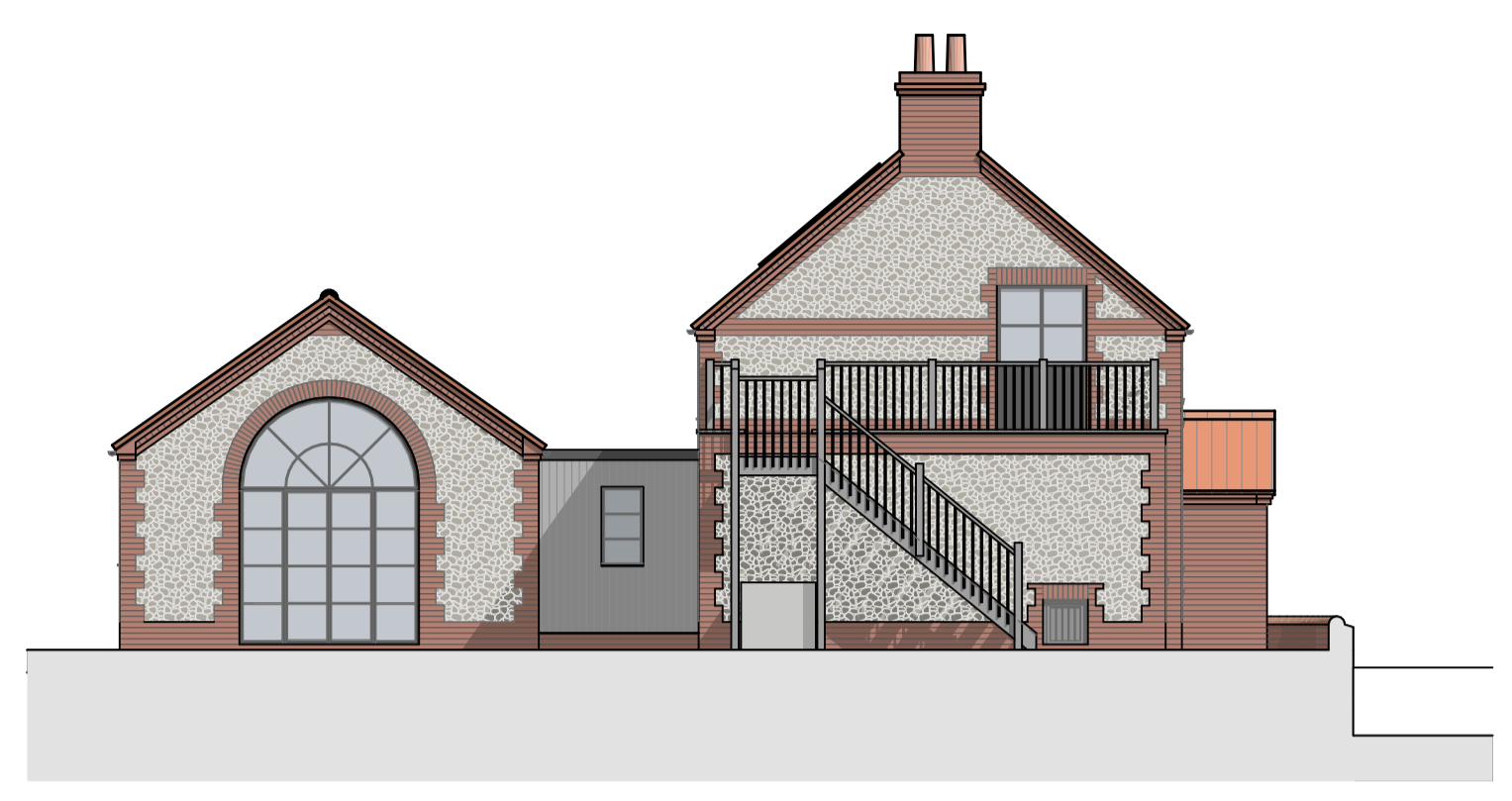
CHA — North West Elevation 1:100