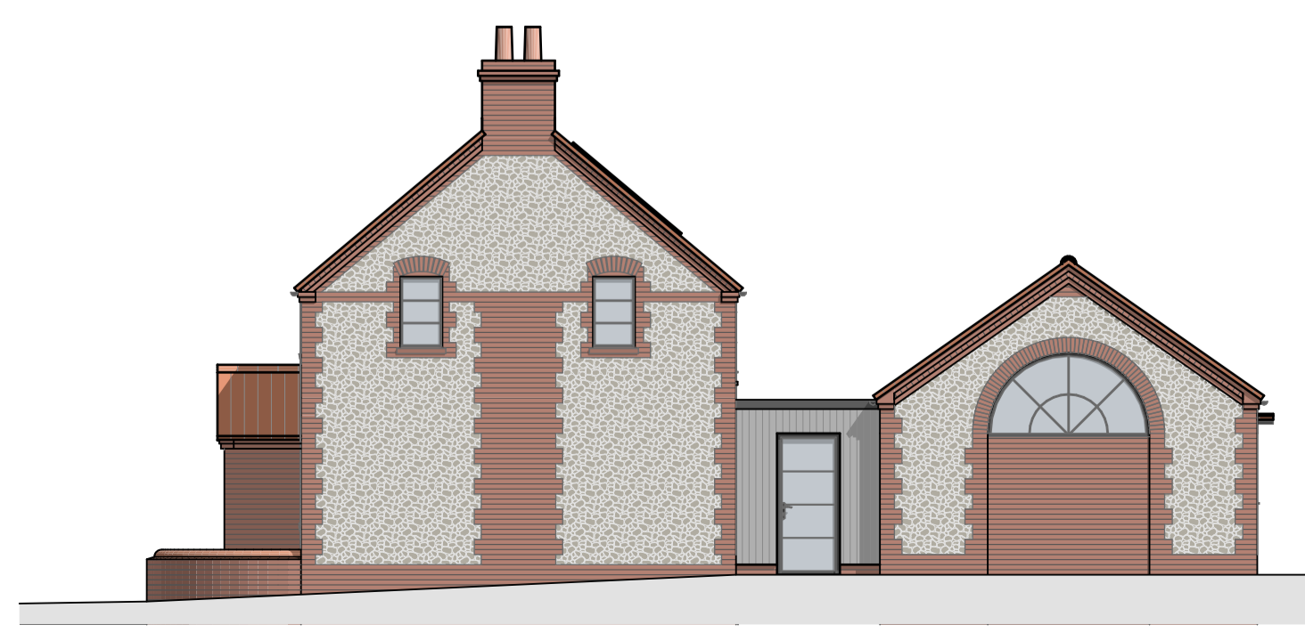
CHA — South East Elevation 1:100