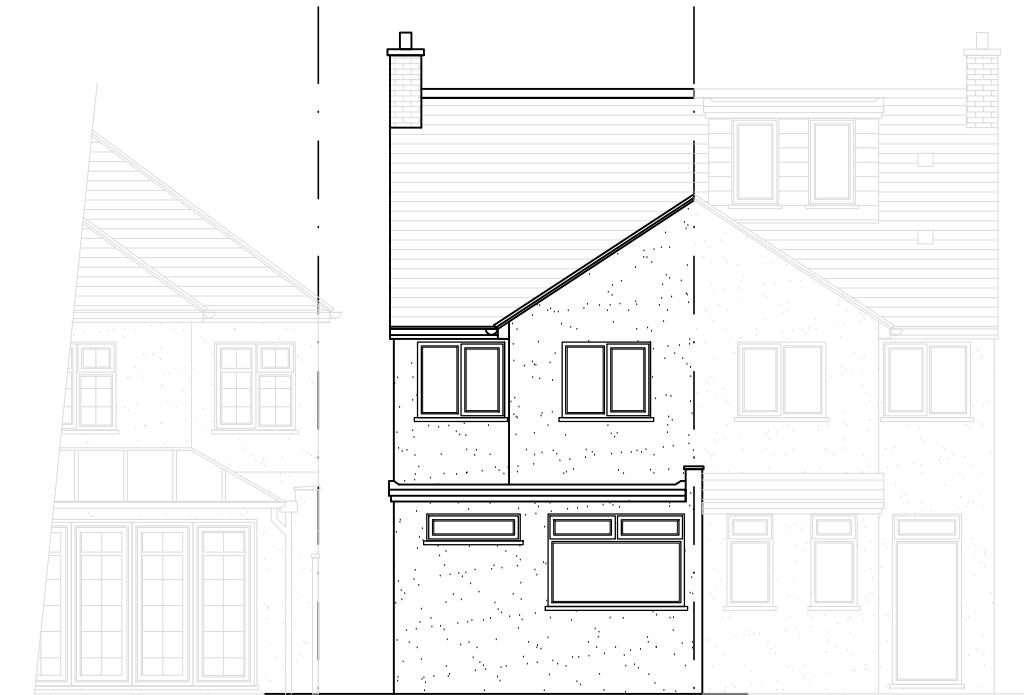
Rear Elevation as Existing