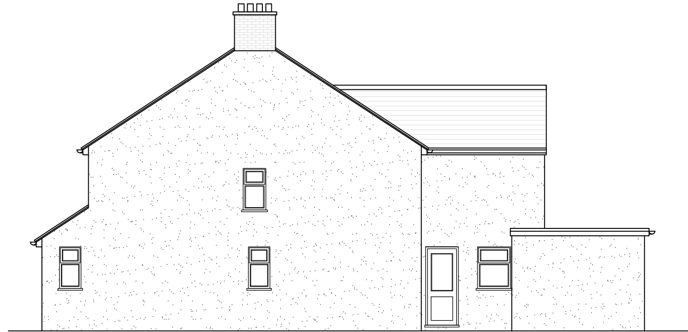
Flank Elevation as Existing