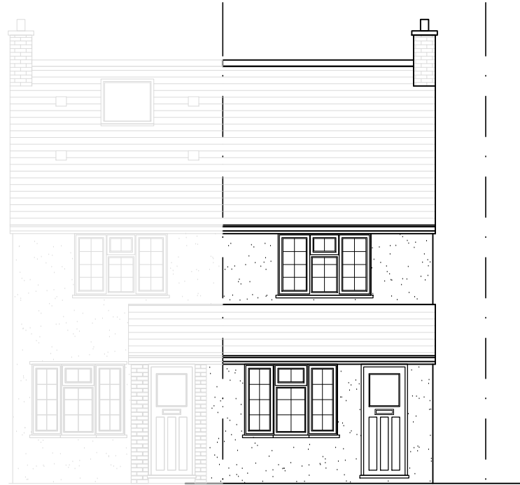
Front Elevation as Existing