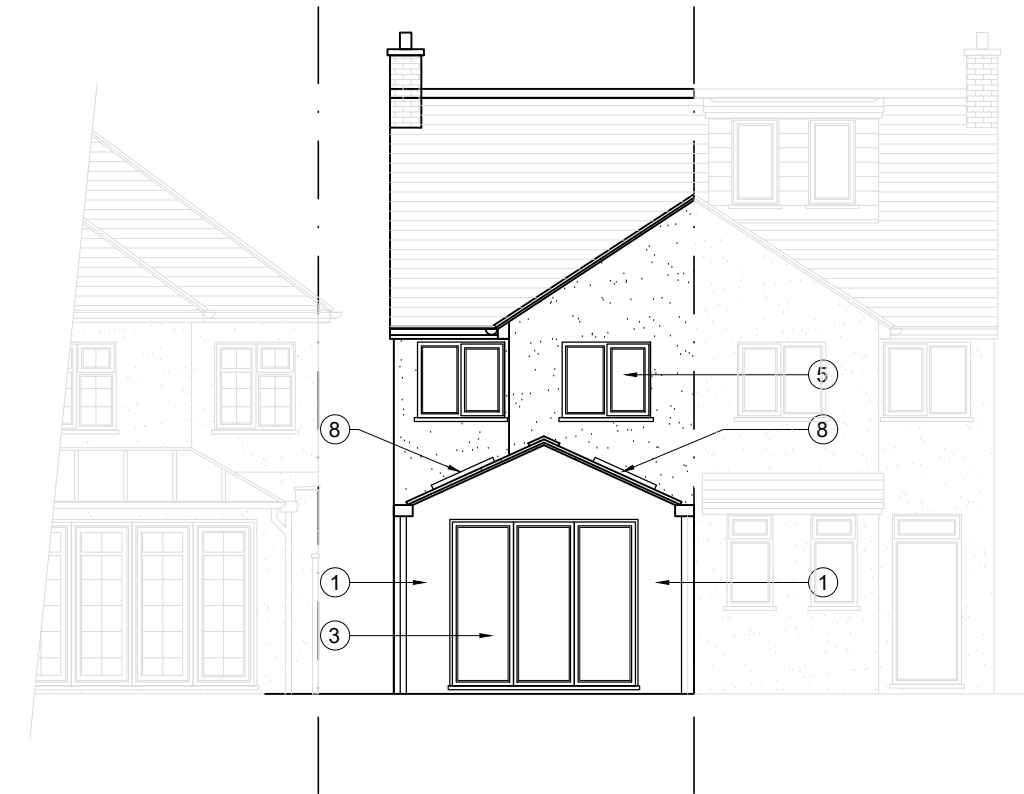
Rear Elevation as Proposed