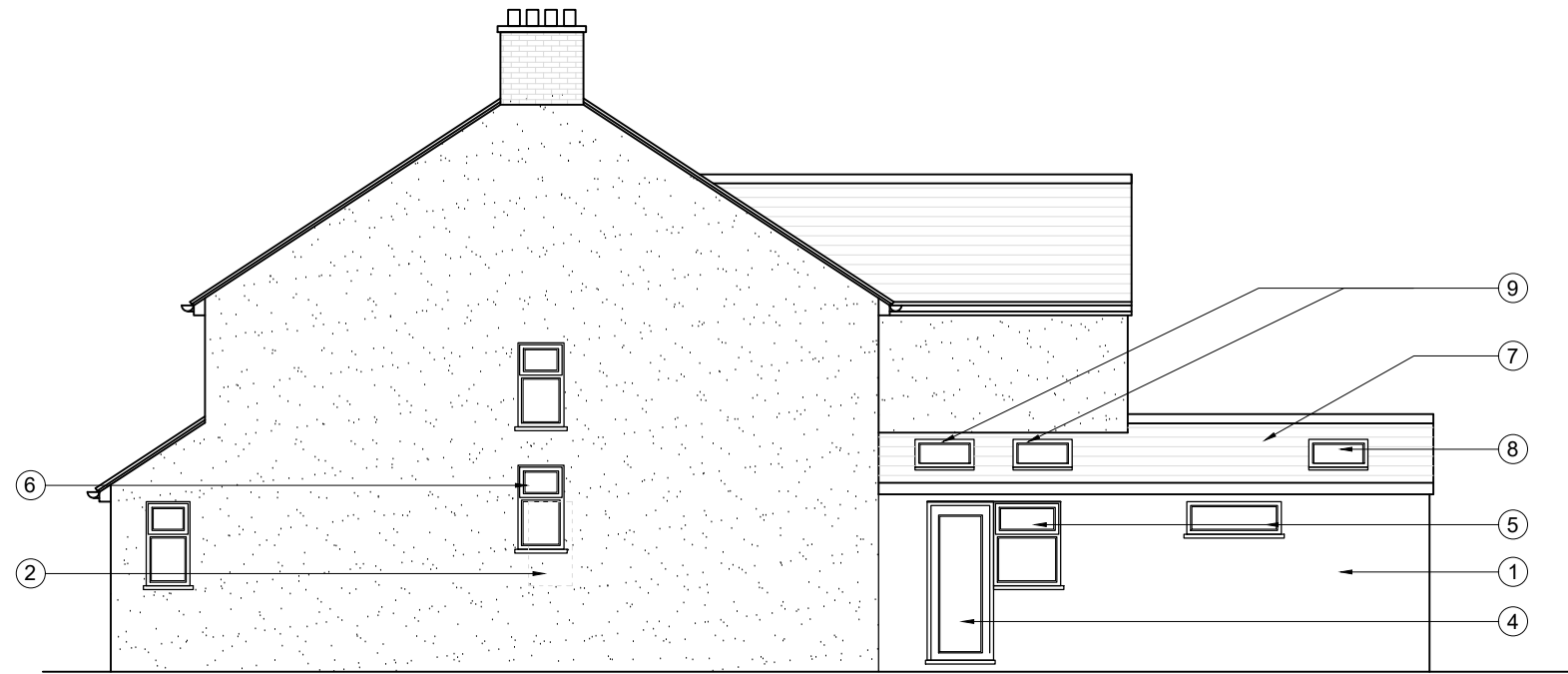
Flank Elevation as Proposed