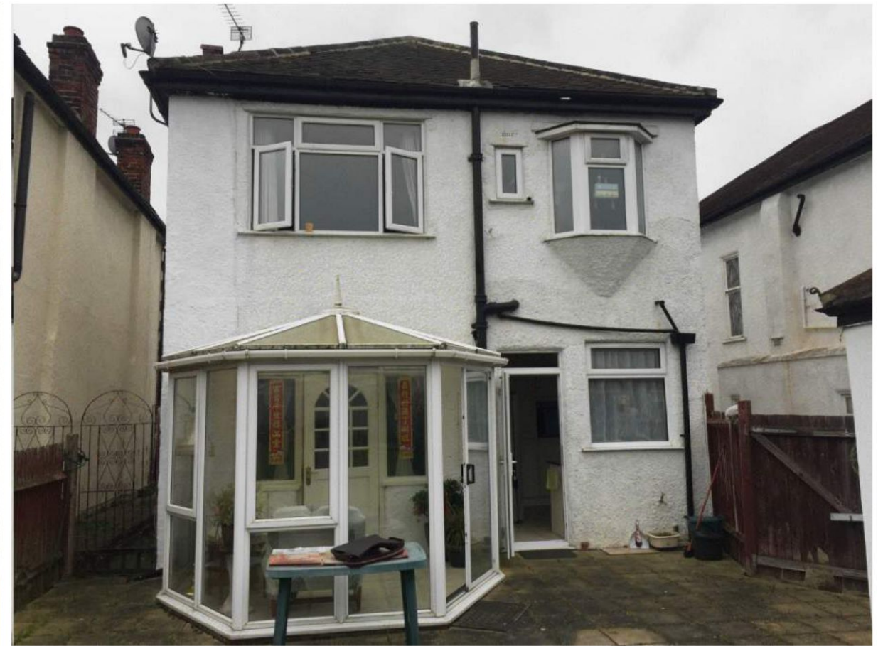
Enlarge Rear View

This scheme is subject to Town Planning and all other necessary consents. Dimensions, areas and levels where given are approximate and subject to site survey. All dimensions are to be checked on site.