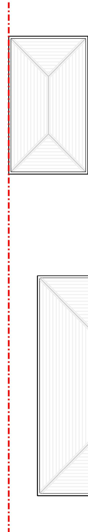
Existing Roof Scale: 1:100