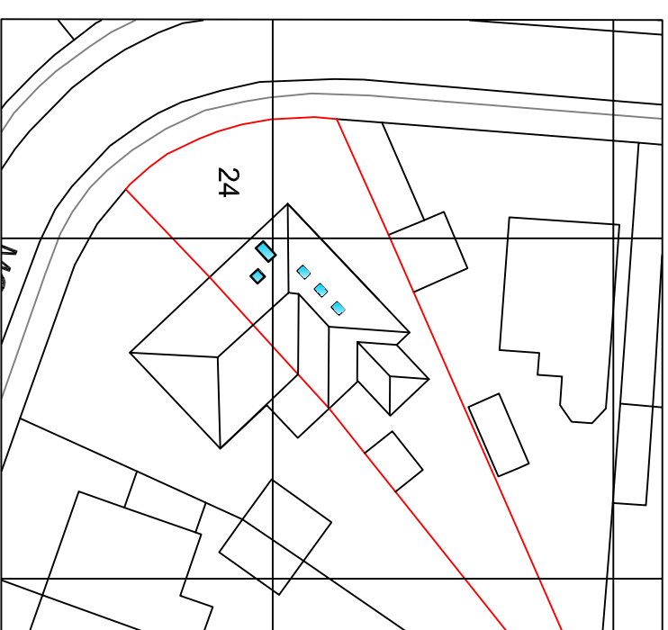
Proposed Site Plan 1:500