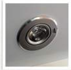
One of the internal LED downlights inside the car.

In the very unlikely event that the lift stops while you are travelling in it, help is just a phone call away.