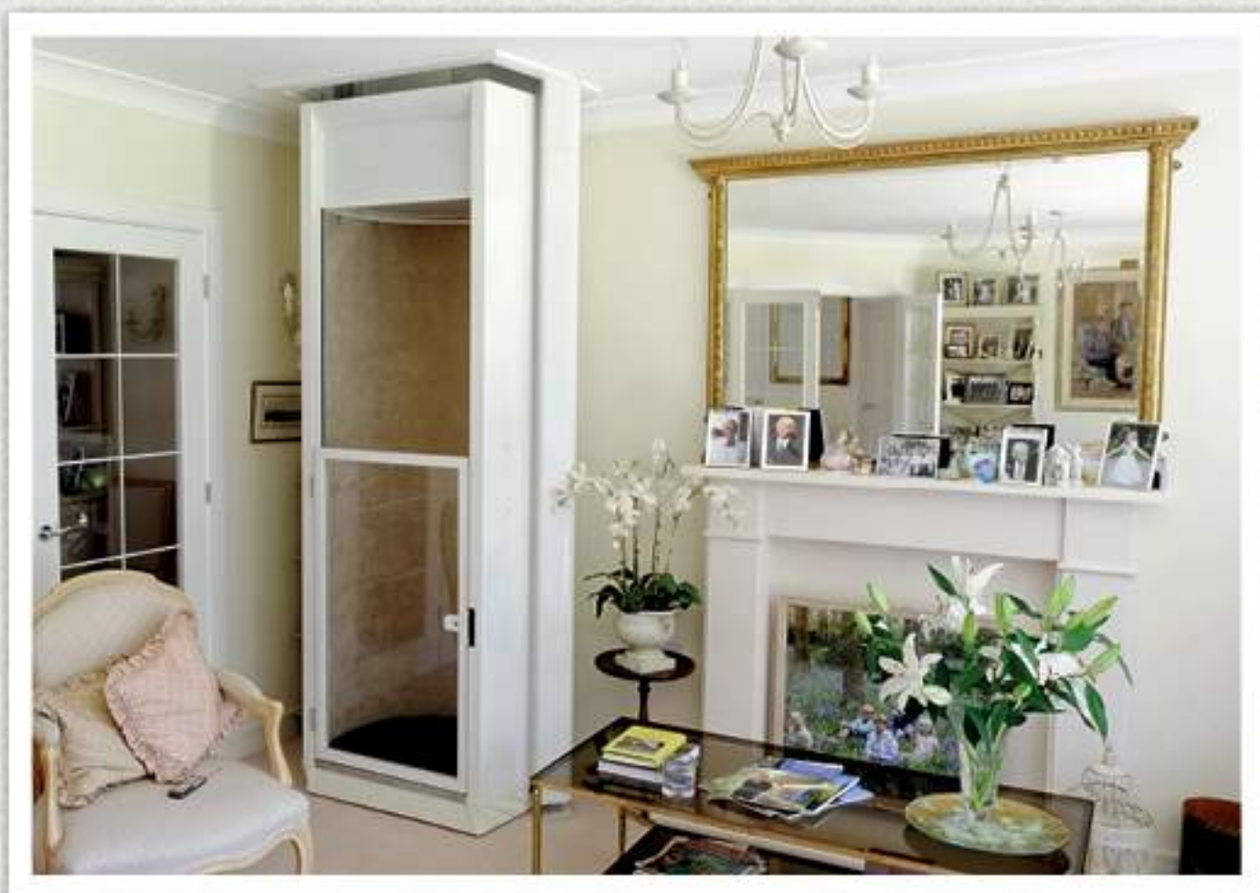
Stiltz Duo Lift