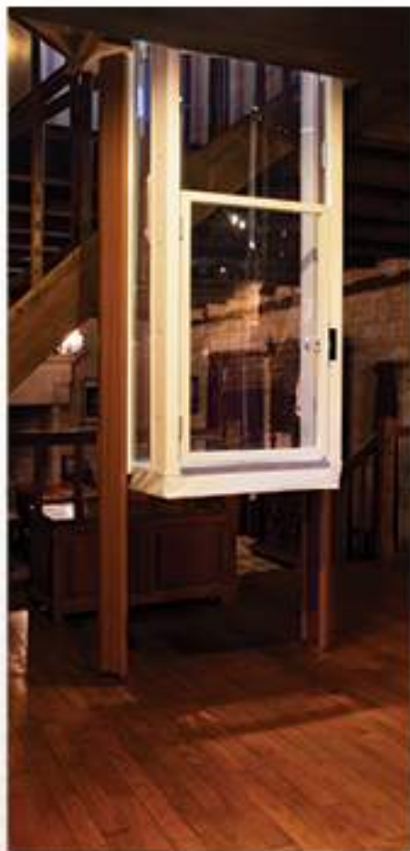
Travel in under 30 seconds