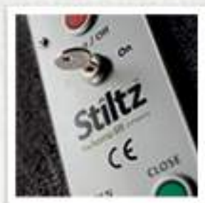
Car operating panel, showing the key switch operation.