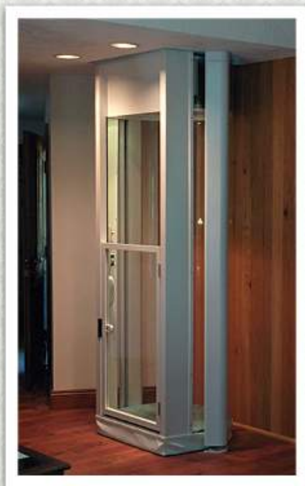
Stiltz Duo Vista Lift

Stiltz lifts are not only sold in the UK. We have qualified agents in other parts of the world. Including Ireland, Russia, Ukraine, Singapore, Canada and USA. If you can't find a dealer where you are, don't worry, just contact us and we will respond to your enquiry.