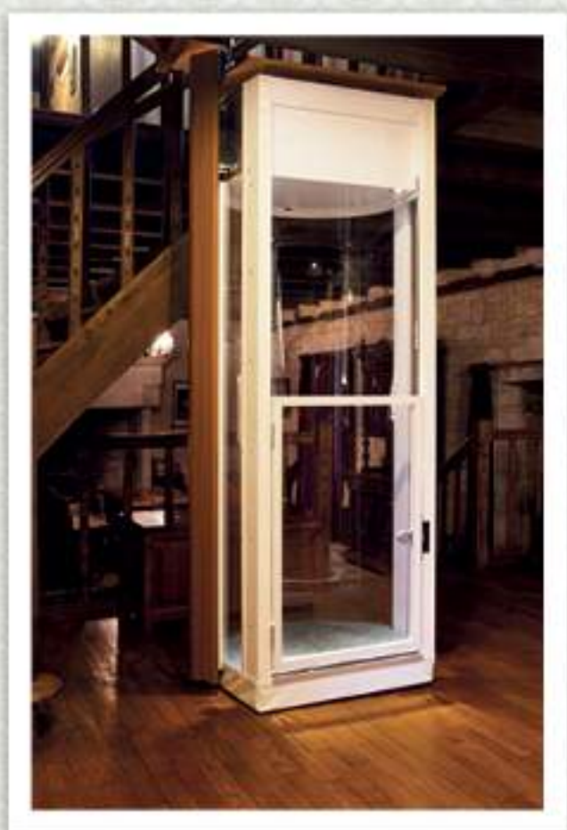
Stiltz Duo Vista Lift