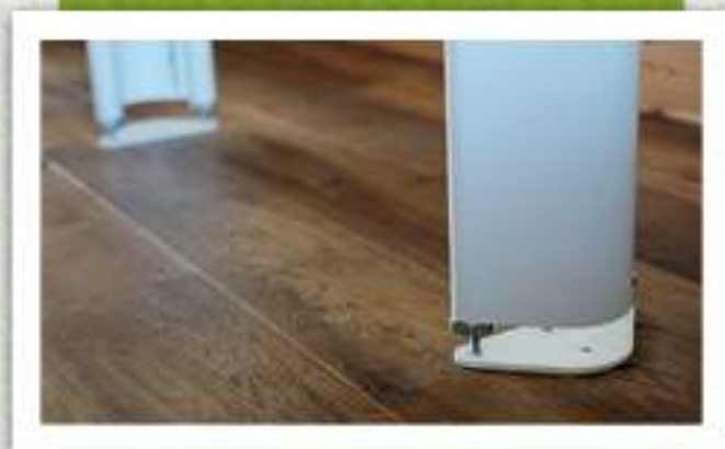
Free standing supports