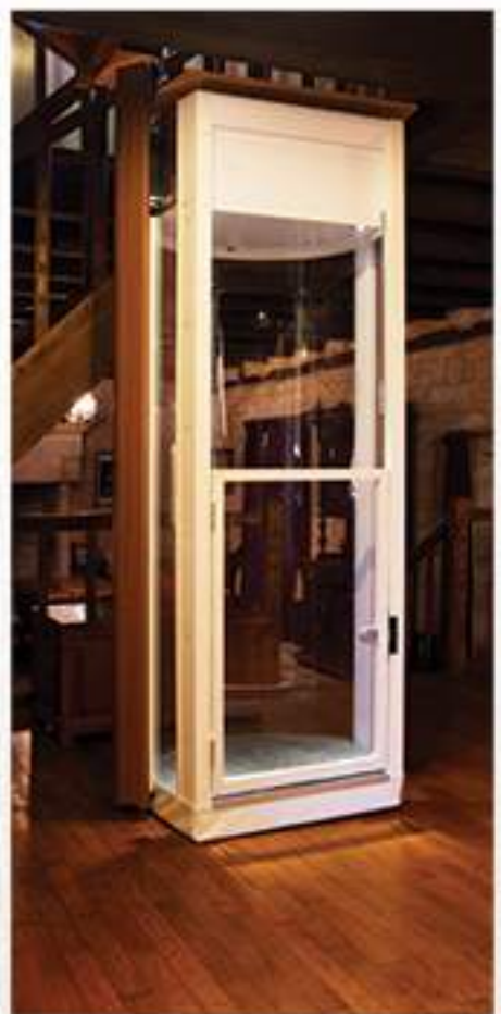
Attractive in any environment