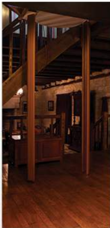
Non-intrusive structural design

All Stiltz Lifts fully comply with the European Machinery Directive 2006/42/EC. This compliance allows all Stiltz Home Lifts to have a CE mark and therefore legally sold throughout Europe. The Trio falls into the machinery directive as it only travels at 0.15 meters per second.