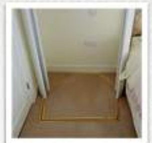
View of upstairs looking at the safety lid plug.

The lift uses an optical sensor to detect the speed of travel. If this increases beyond the specified limit, the lift will stop.