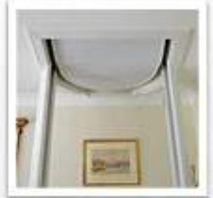
View of downstairs looking up at underside of the lift.