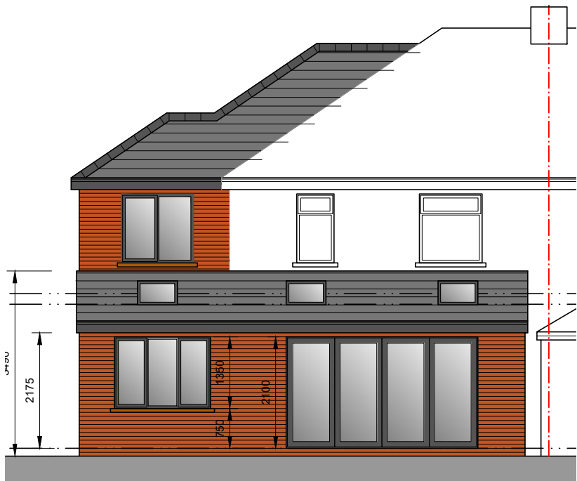
West Facing Rear Elevation