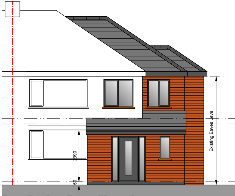
East Facing Front Elevation