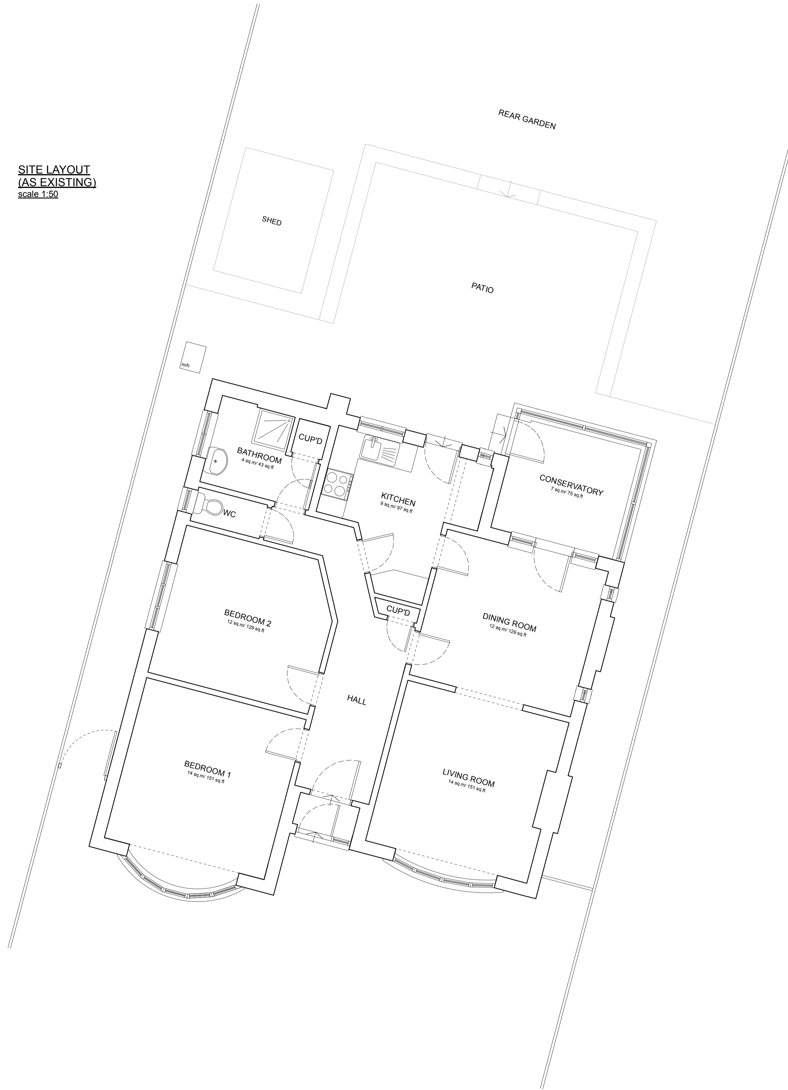
SITE LAYOUT (AS EXISTING) scale 1:50