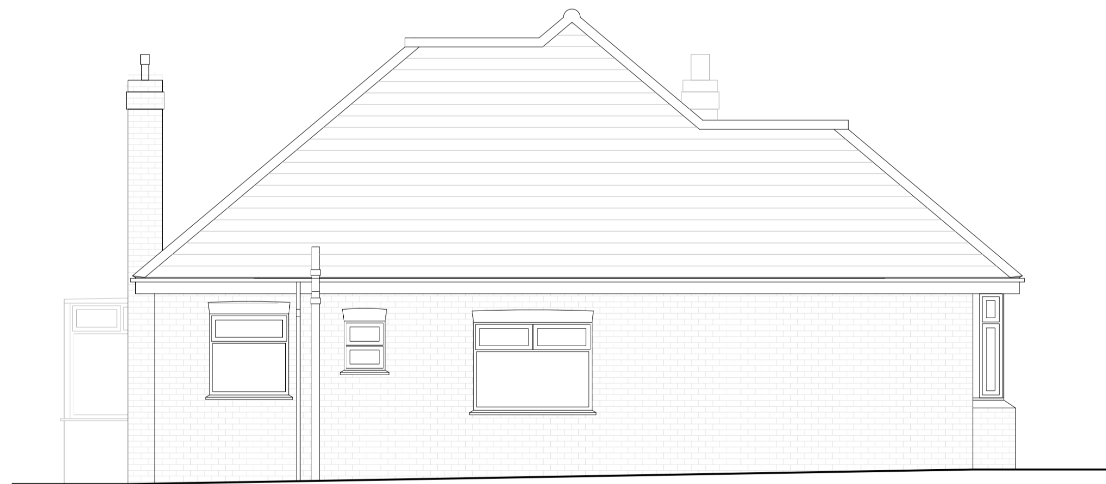
SIDE ELEVATION - NORTH WEST FACING (AS EXISTING) scale 1:50