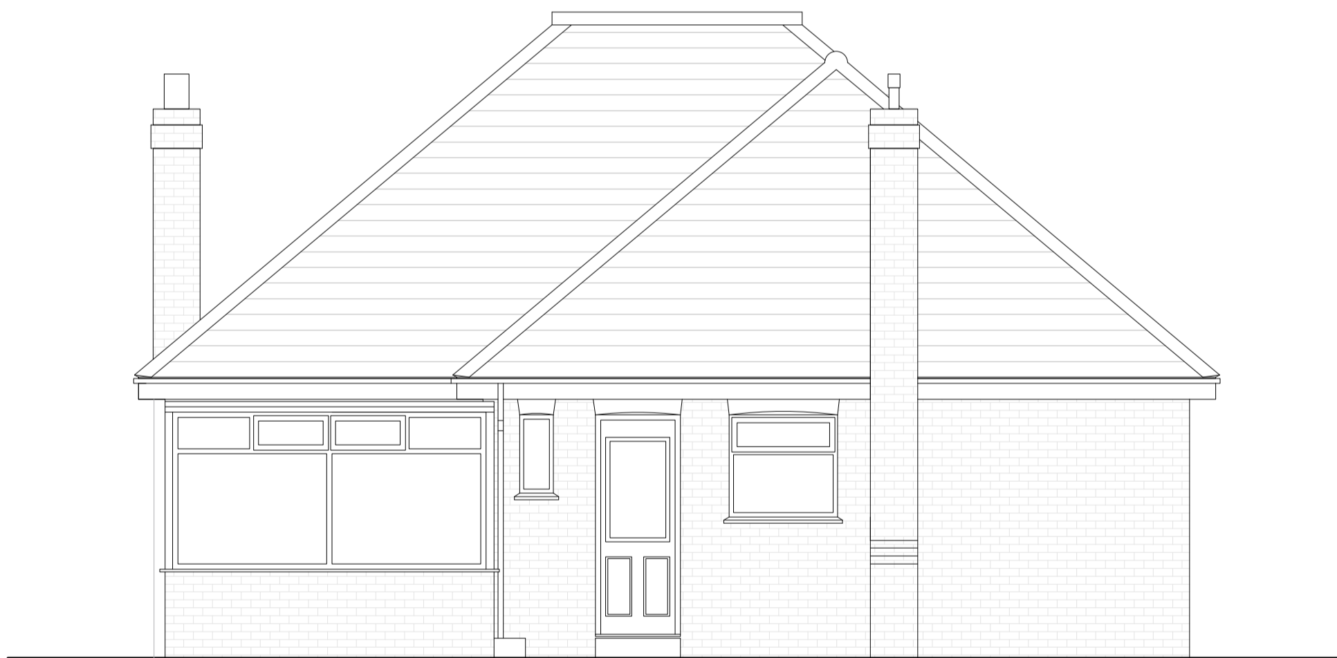
REAR ELEVATION - NORTH EAST FACING (AS EXISTING) scale 1:50