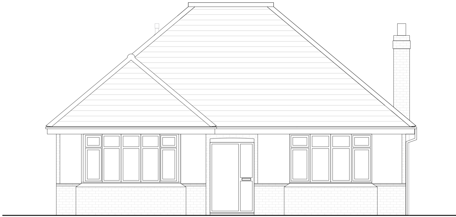
FRONT ELEVATION - SOUTH WEST FACING (AS EXISTING) scale 1:50